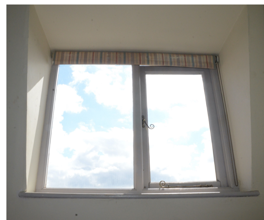
Examples of existing window TH-8

Notes This drawing is to be read with: All other architectural drawings, schedules and outline specification Structural Engineer's information M&E Engineer's information Acoustic Consultant's information