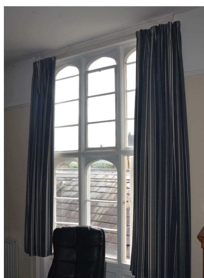
Existing Window TH-2

- Dimensions may vary between windows of the same type. All windows will need to be individually measured by the contractor prior to fabrication of the secondary glazing.