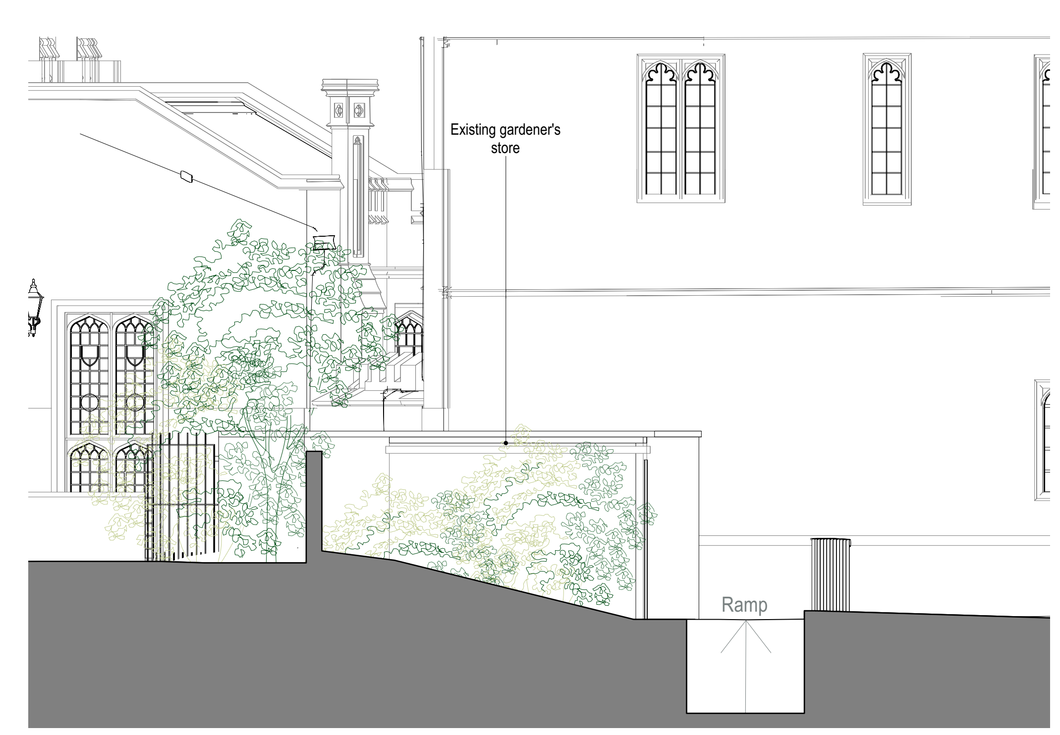
Section/ Elevation 01 North 1:50 @ A1