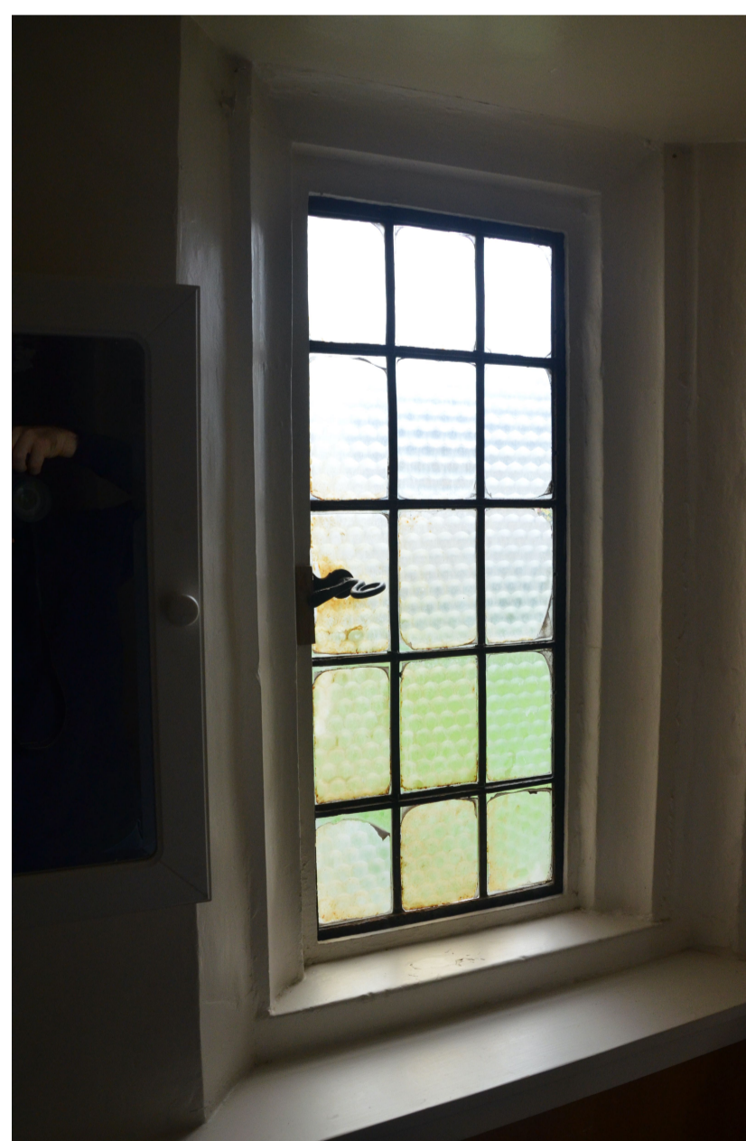
Existing Window S-2

- Dimensions may vary between windows of the same type. All windows will need to be individually measured by the contractor prior to fabrication of the secondary glazing.