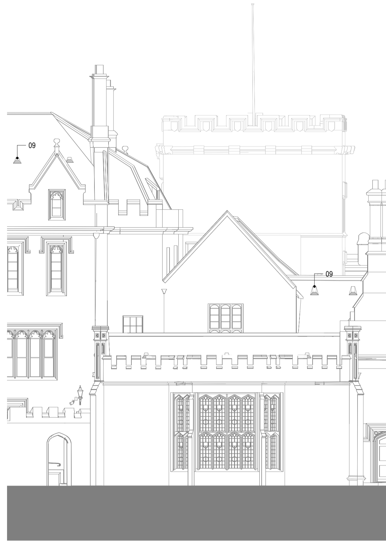
Elevation 10 Broadgates Hall west elevation 1:100@A1