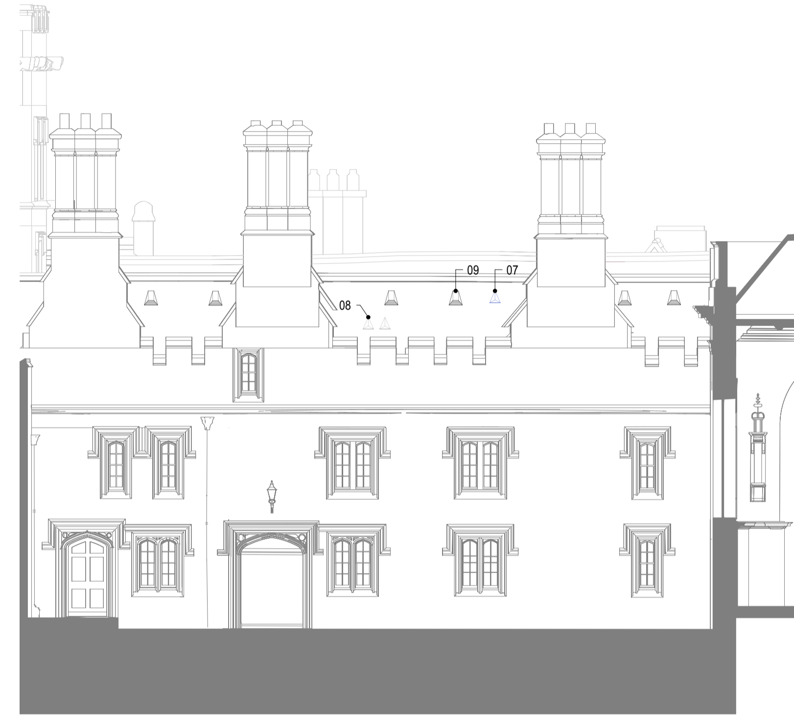
Elevation 08 Old Quad west elevation 1:100@A1