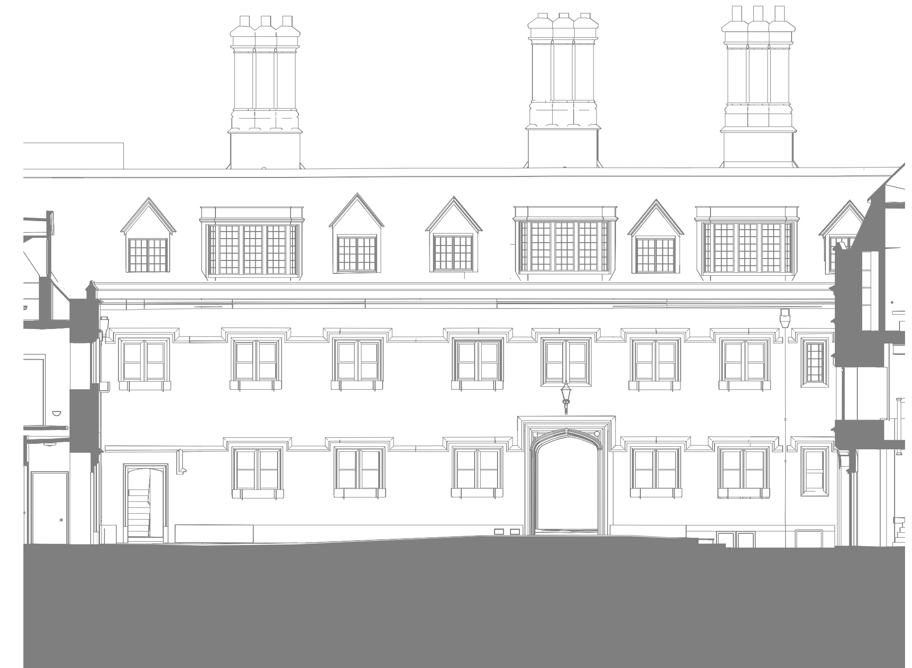
Elevation 04 Old Quad courtyard elevation 1:100@A1