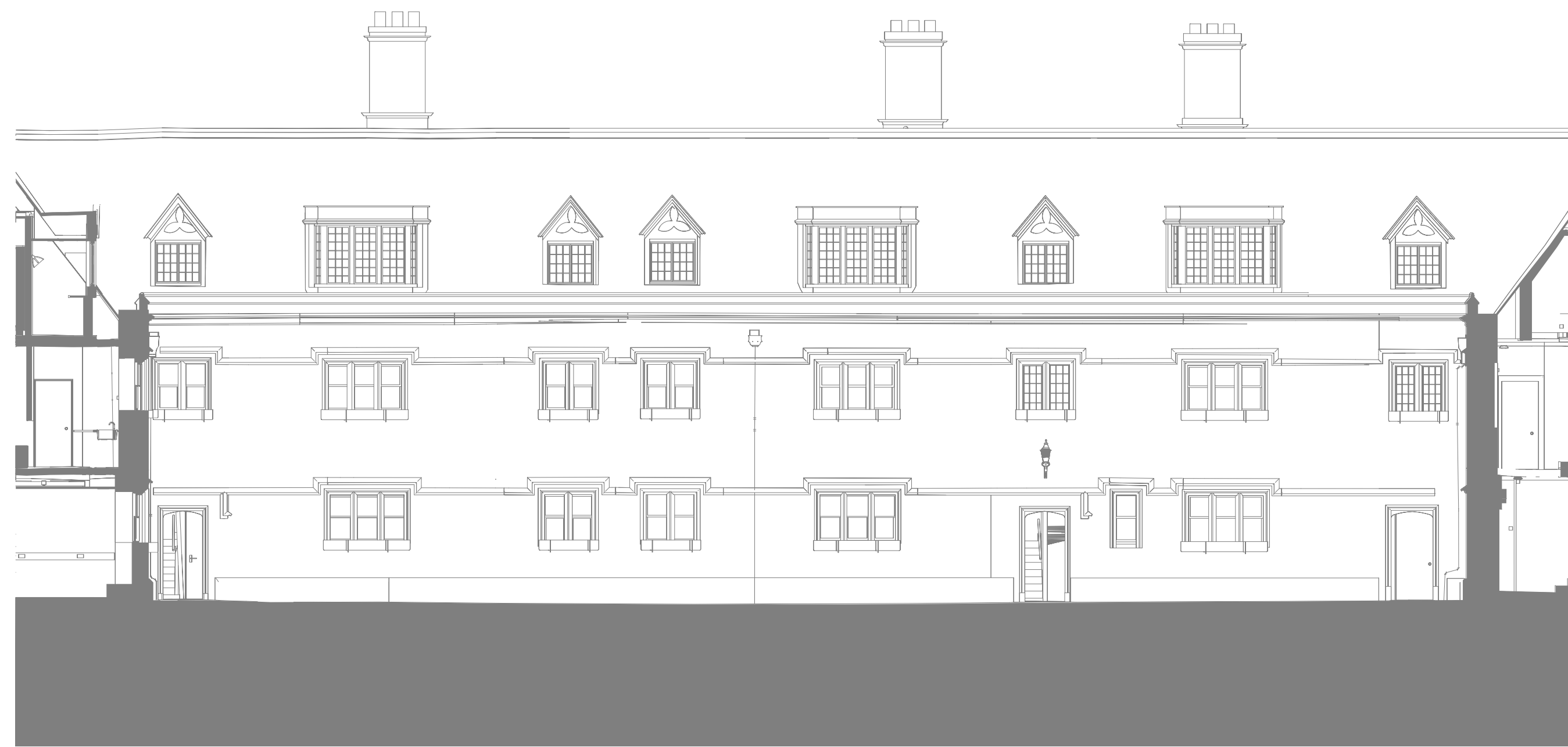
Elevation 03 Old Quad courtyard elevation 1:100@A1