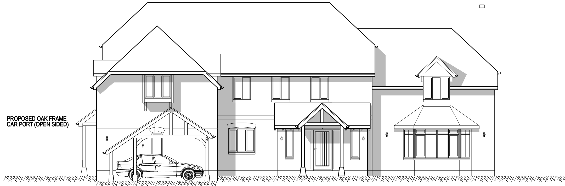
PROPOSED OAK FRAME CAR PORT (OPEN SIDED) PRINCIPAL ELEVATION