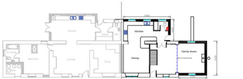
Proposed Ground Floor Plan - as amended