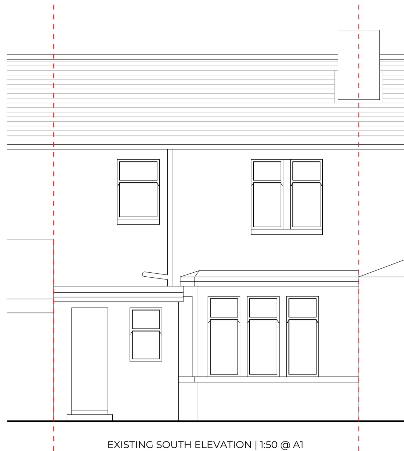
EXISTING SOUTH ELEVATION | 1:50 @ A1