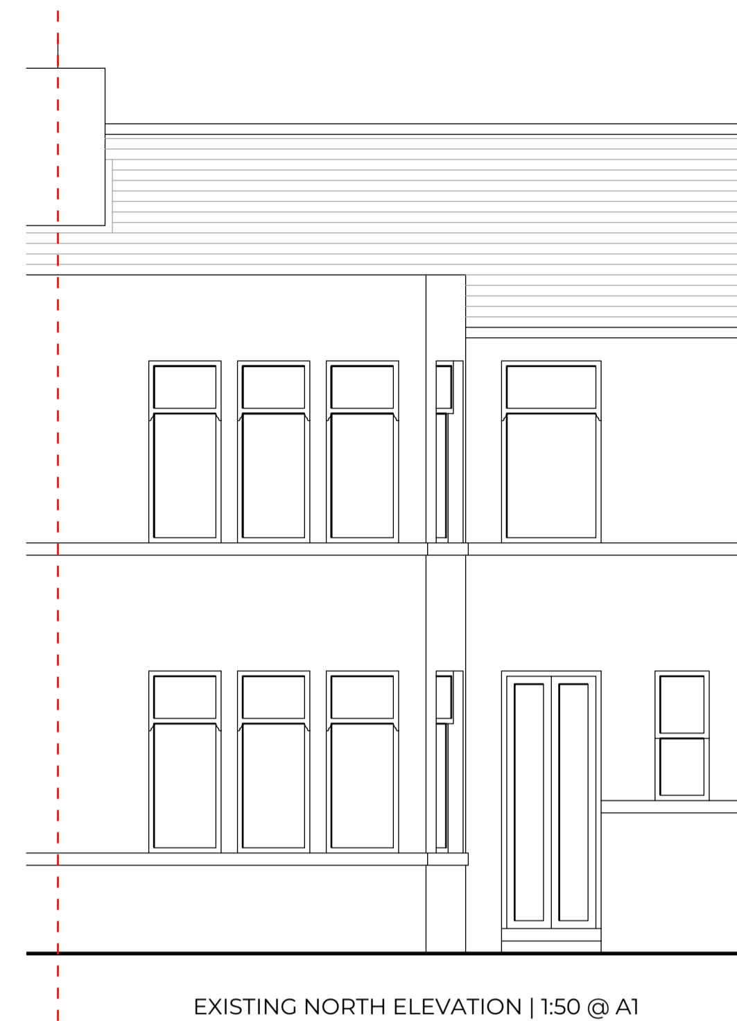
EXISTING NORTH ELEVATION | 1:50 @ A1