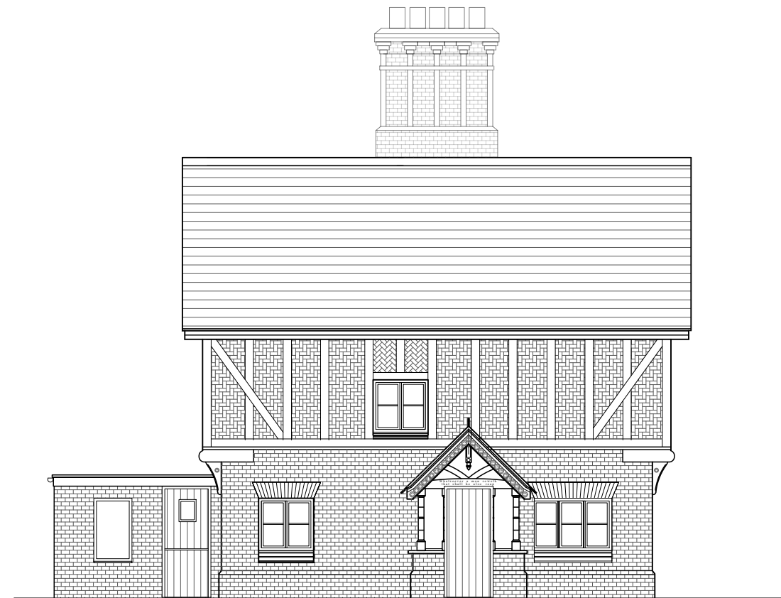
Existing Side Elevation (South West)