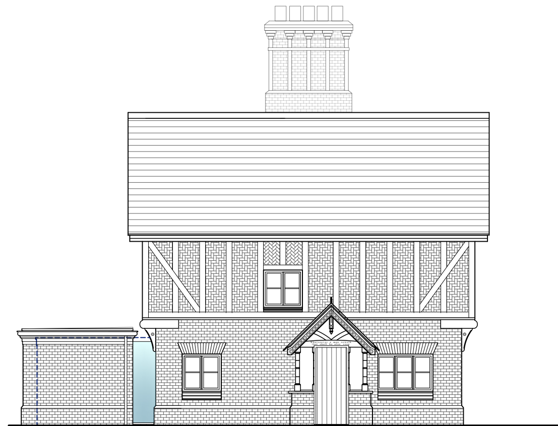
Proposed Side Elevation (South West)