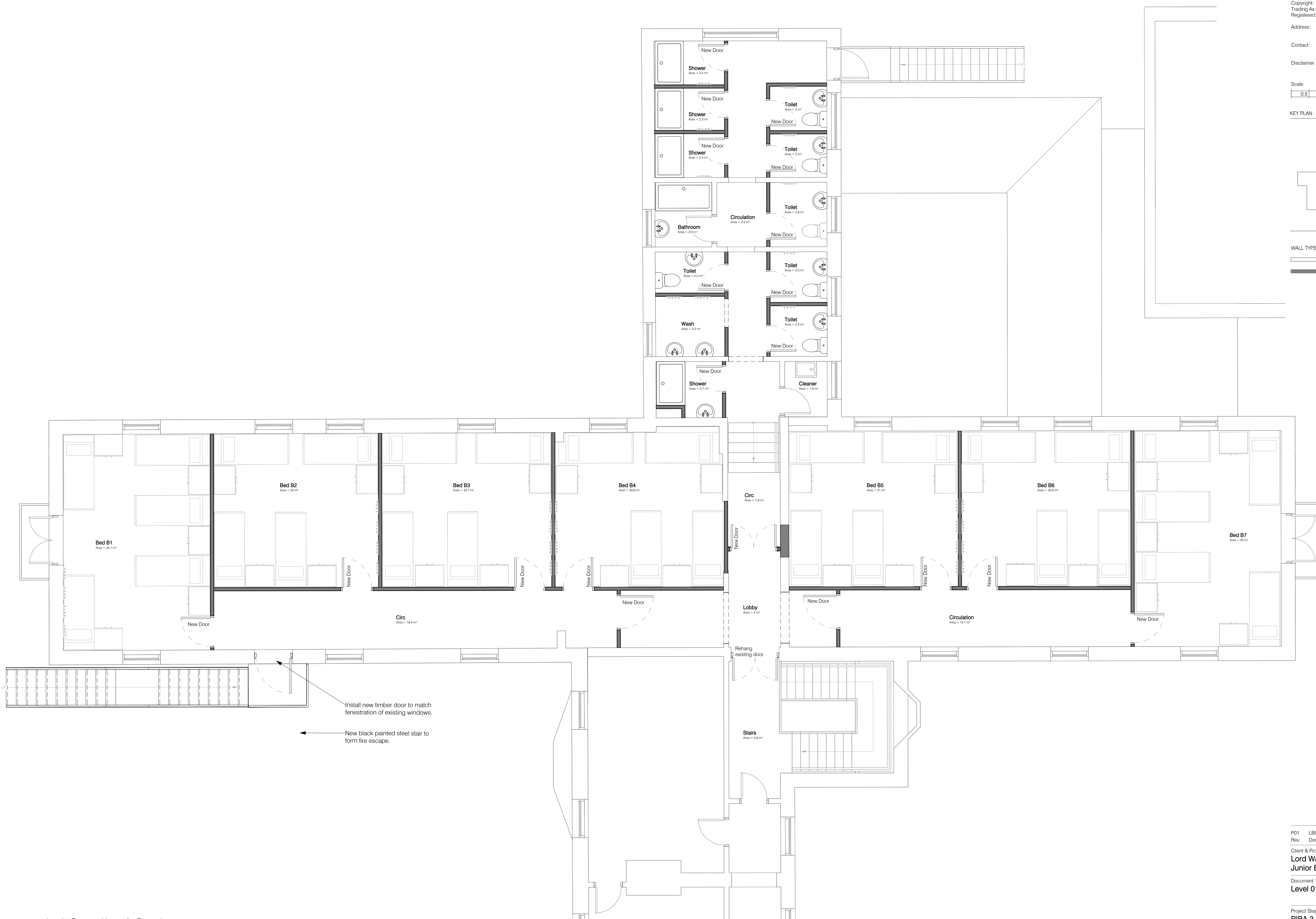
Level 1 Proposed layout for Boys wing 1:50