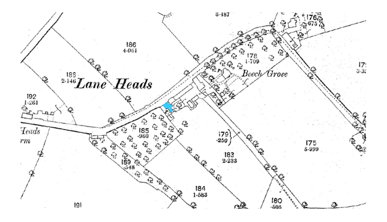
Figure 2: 1<sup>st</sup> Edition 1:2500 OS Plan (NTS) –original building shaded pale blue