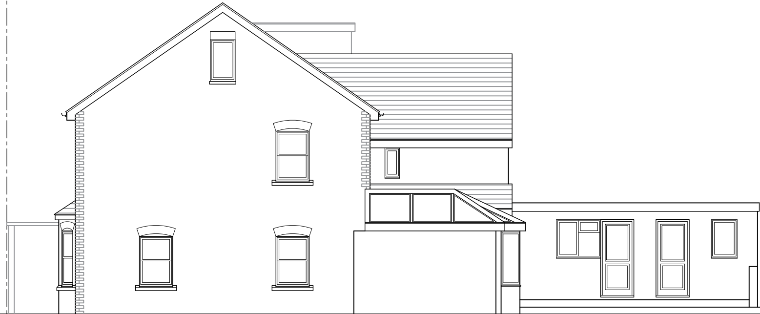
Side Elevation - South East