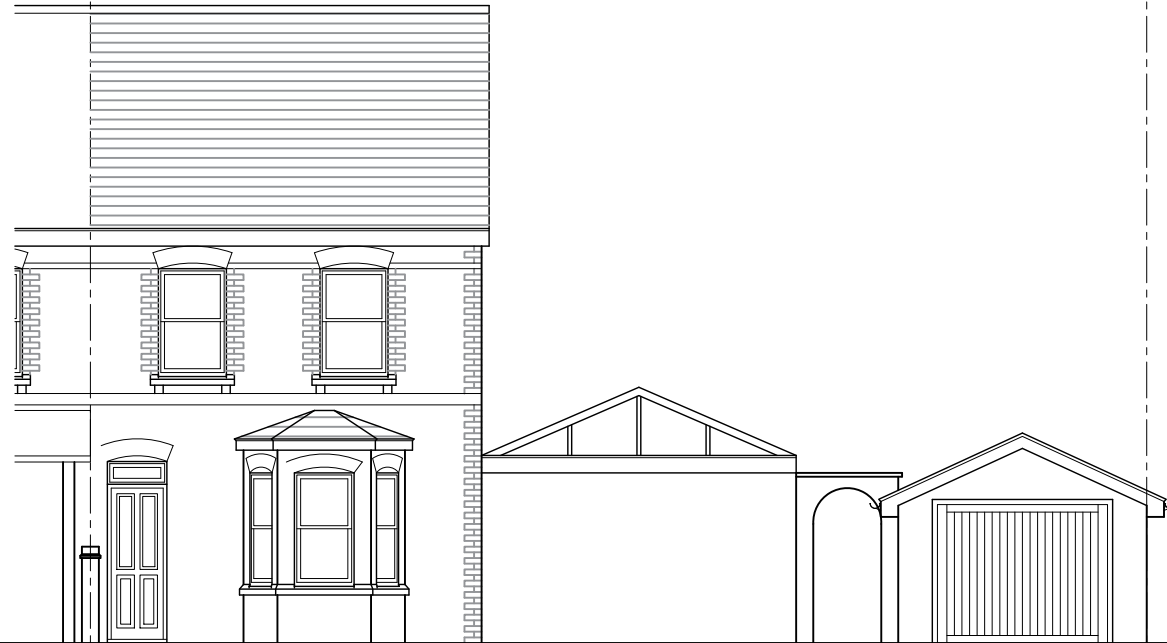
Front Elevation - South West