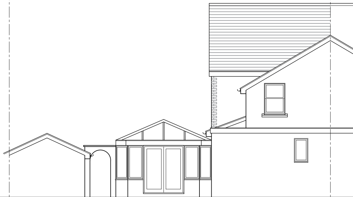
Rear Elevation - North East