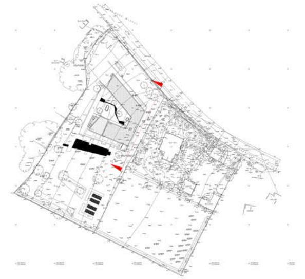
KEY SITE PLAN - 1:1000 @ A3