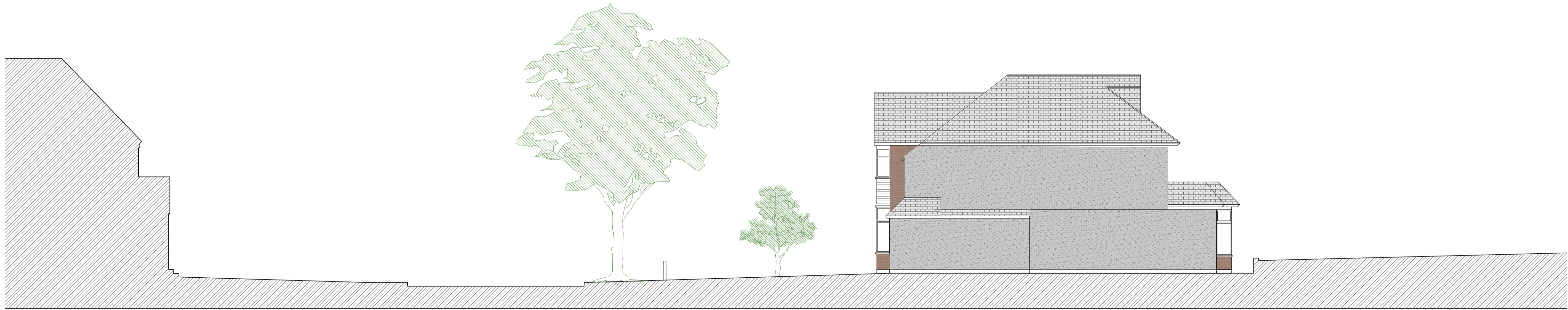
Right side Elevation - Proposed scale 1:100