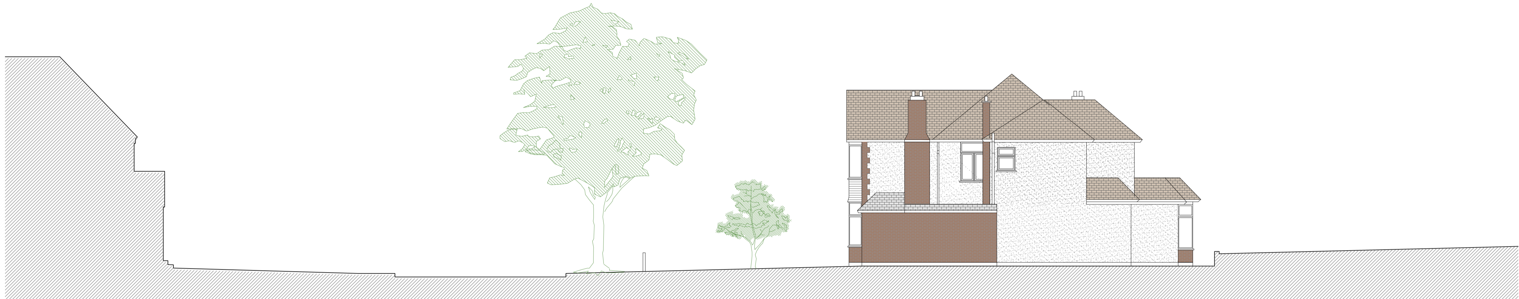
Right side Elevation - Existing scale 1:100