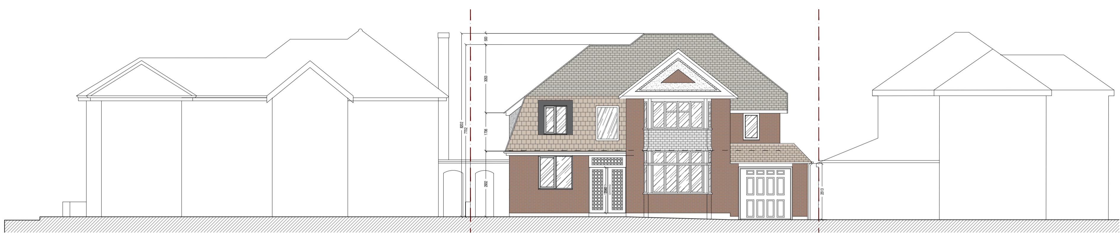
Front Elevation - Proposed scale 1:100