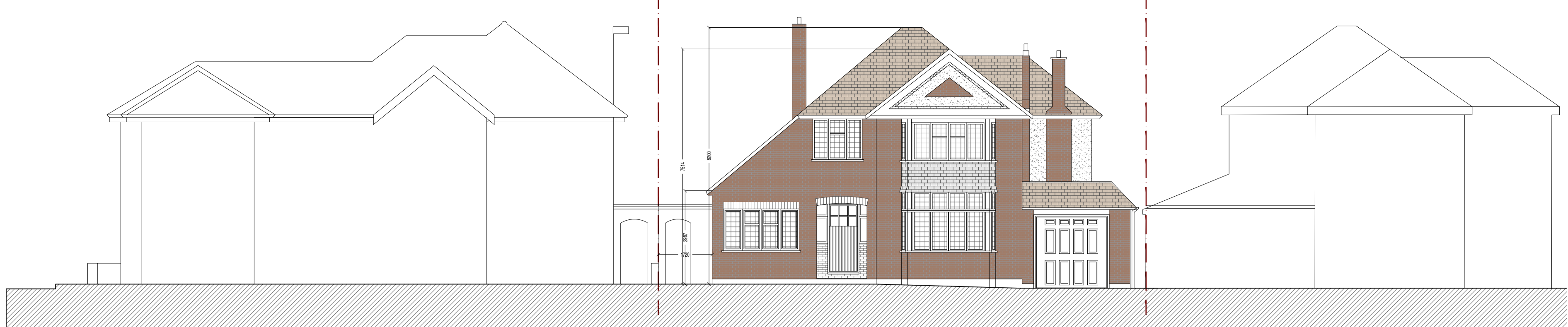
Front Elevation - Existing scale 1:100