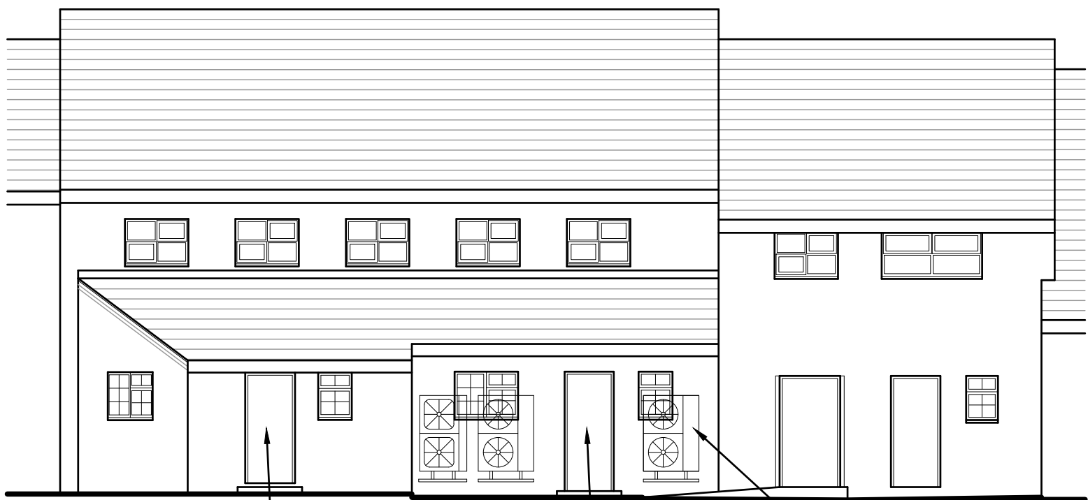
② Rear Elevation Scale 1:100