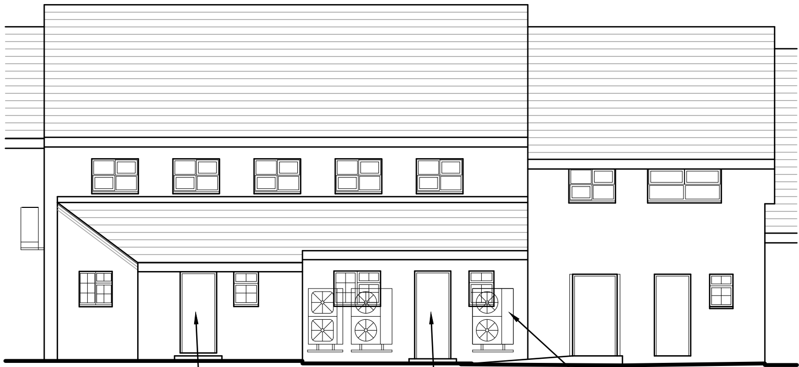
② Rear Elevation Scale 1:100