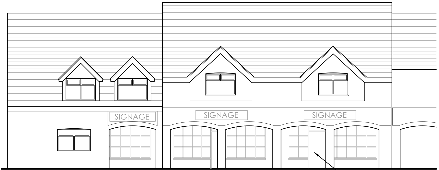
① Front Elevation Scale 1:100