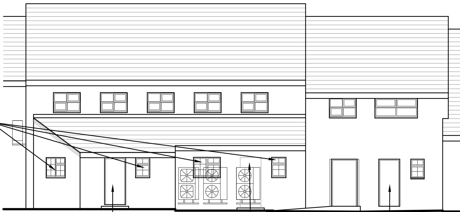
② Rear Elevation Scale 1:100

Frontage of units within undercroft (ground floor only)