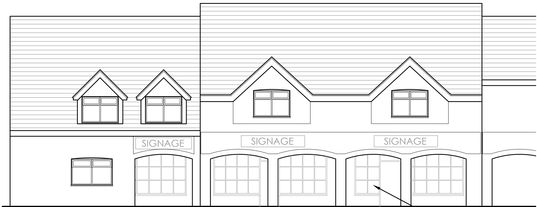
① Front Elevation Scale 1:100

Frontage of units within undercroft (ground floor only)