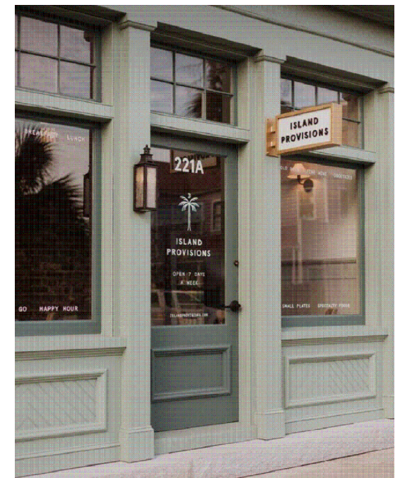
SIMILAR DESIGN PROPOSED