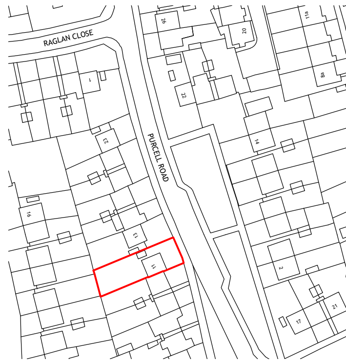
location plan scale 1:1250