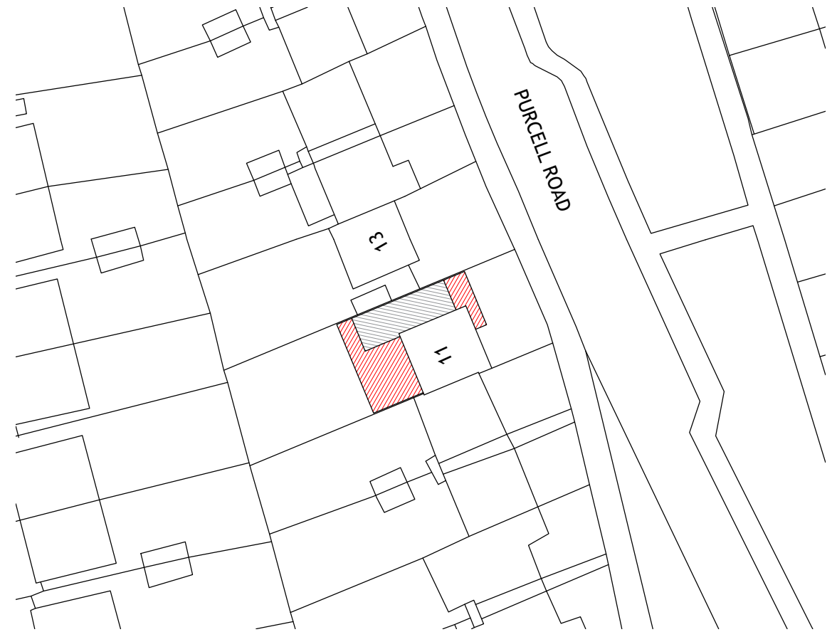
block plan scale 1:500