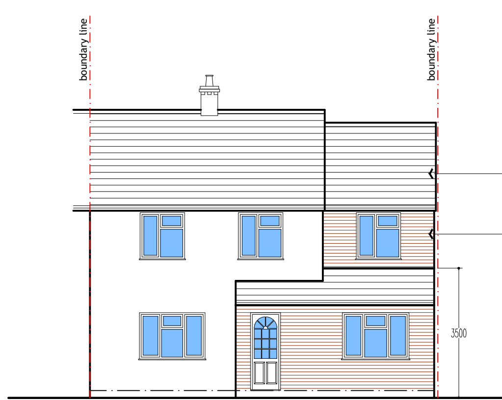
proposed front elevation