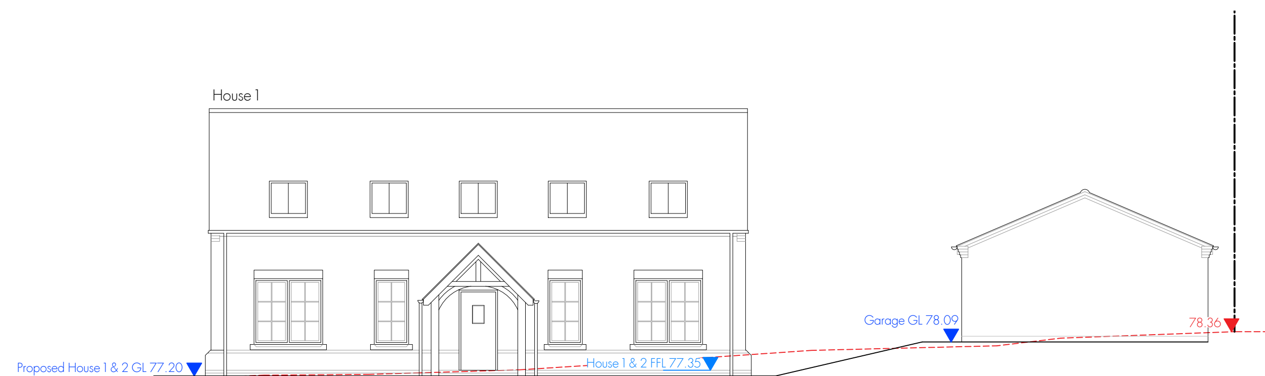
Proposed Driveway Elevation with Levels - Scale 1:100

DISCLAIMER NOTES DRAWING SUBJECT TO FOLLOWING CONDITIONS: SITE LEVEL SURVEY CONFIRMATION OF LEGAL BOUNDARY & EASEMENTS GROUND INVESTIGATION BY OTHERS STATUTORY AUTHORITY SERVICES INVESTIGATION PLANNING AUTHORITY COMMENTS/APPROVAL HIGHWAY AUTHORITY COMMENTS/APPROVAL CONSERVATION OFFICER COMMENTS/APPROVAL BUILDING CONTROL OFFICER COMMENTS/APPROVAL FLOOD RISK ASSESSMENT PARTY WALL ACT 1996