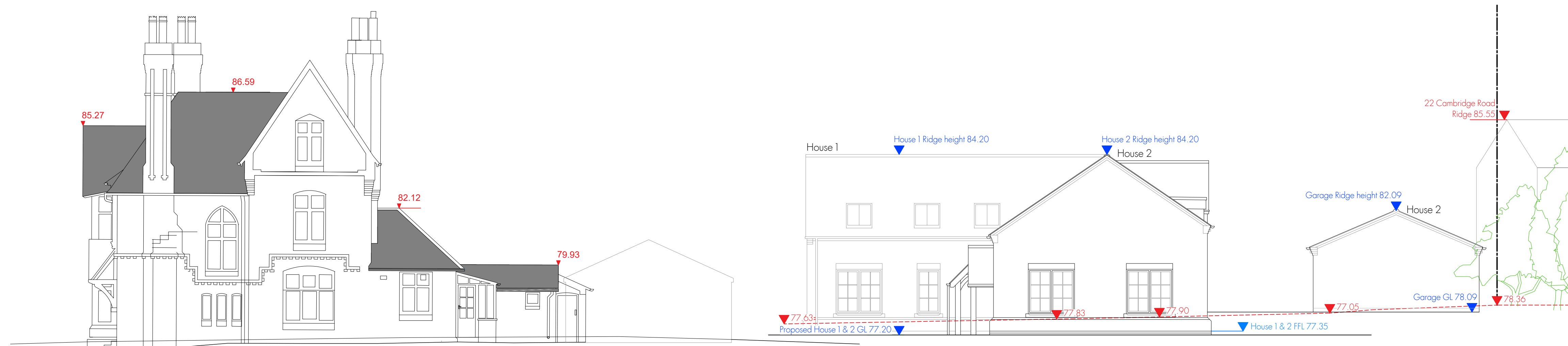
Cambridge Road Elevation with Levels - Scale 1:100