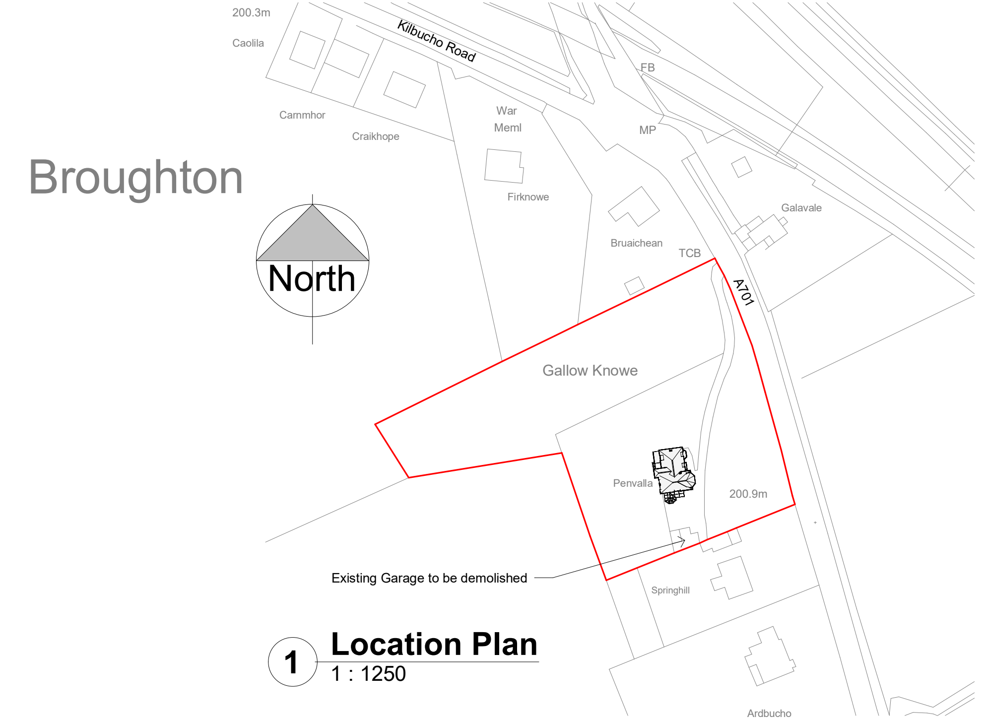
1 Location Plan 1 : 1250

ALL DIMENSIONS AND LEVELS ARE TO BE CHECKED ON SITE ANY DISCREPANCIES ARE TO BE REPORTED TO THE PROJECT MANAGER BEFORE ANY WORK COMMENCES THIS DRAWING SHALL NOT BE SCALED TO ASCERTAIN ANY DIMENSIONS WORK TO FIGURED DIMS ONLY THIS DRAWING SHALL NOT BE REPRODUCED WITHOUT EXPRESS WRITTEN PERMISSION FROM Clarkes Bespoke Design LTD.