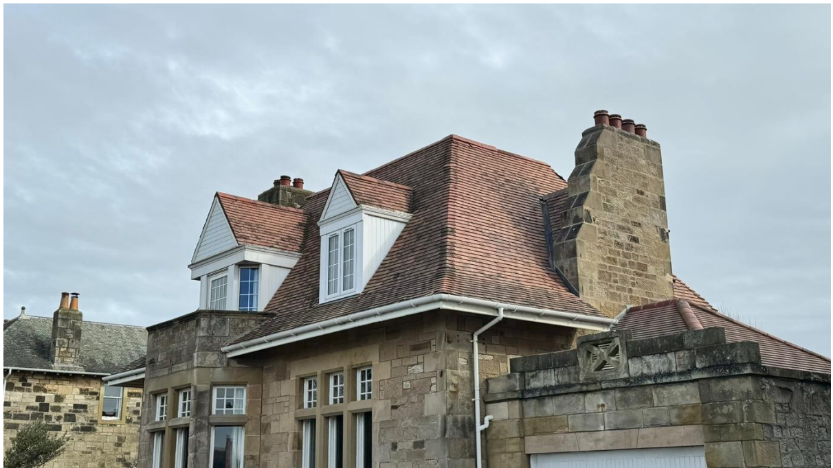
North and South West Facing elevations. All tiles replaced, except small roof above garage, on the right.