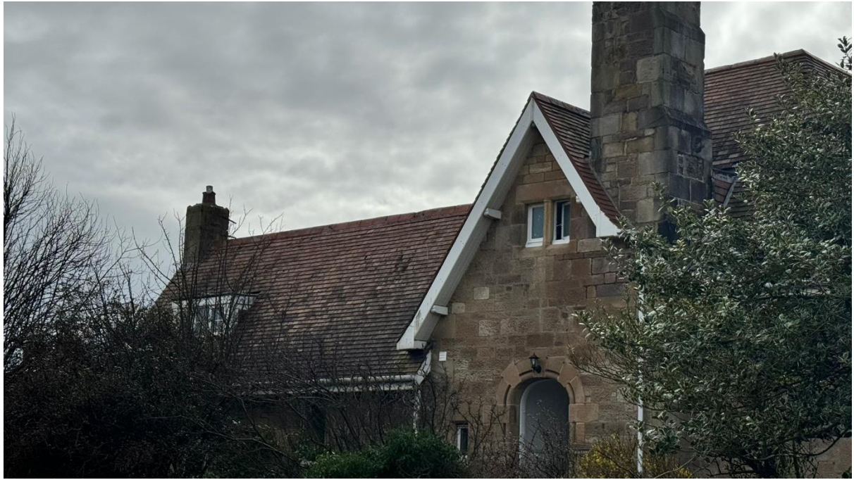
North East facing elevation. All tiles replaced.