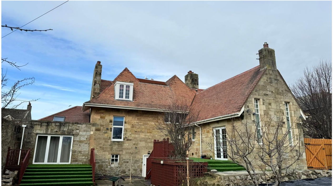
Rear of the property. Small roof on the left will not have tiles replaced, all other areas will.