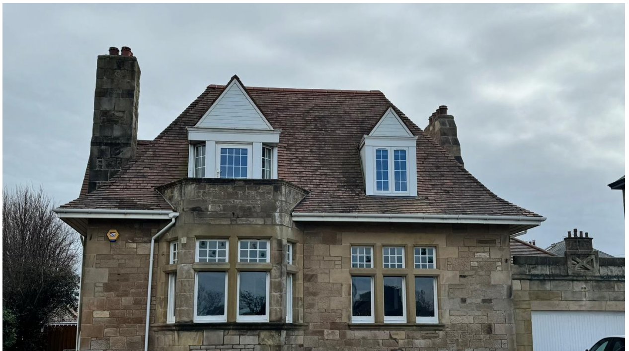
Front of the property. All tiles replaced.