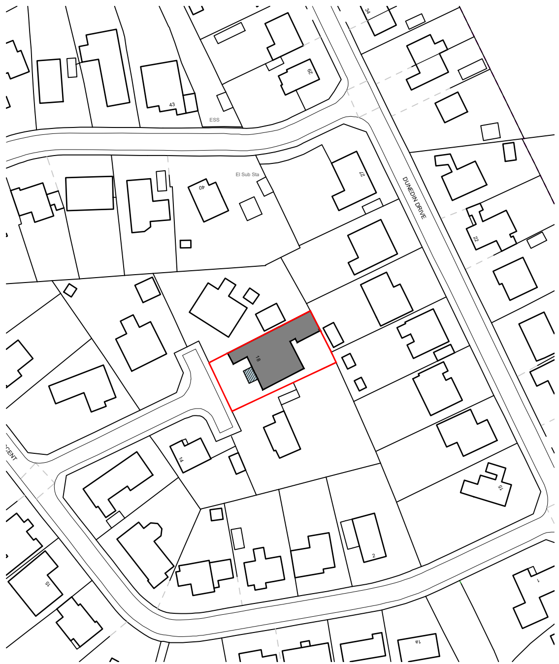
Proposed Location Plan 1:1250 0 5 10 20 50 100m