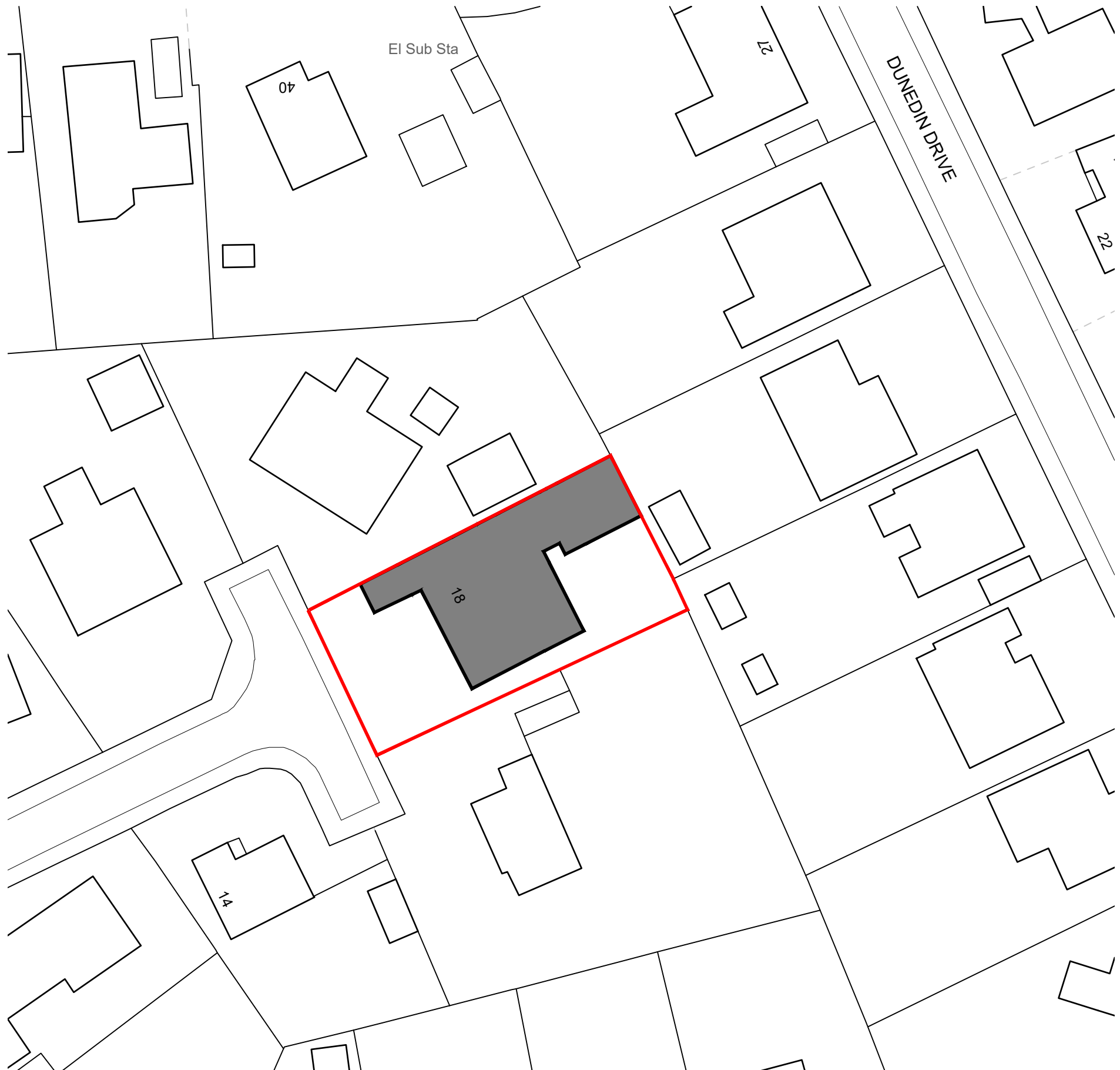
Existing Block Plan 1:500