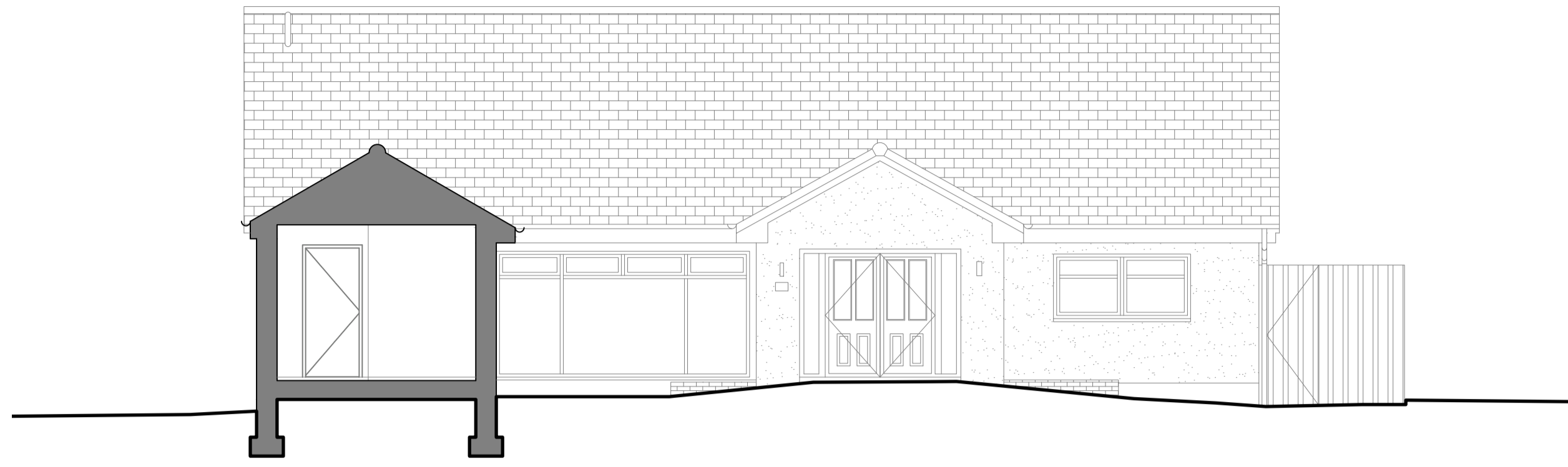
Existing Section A 1:75