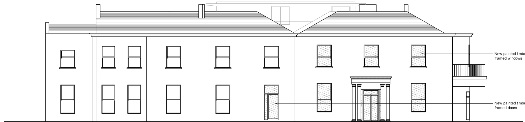
Proposed Side Elevation 'B'