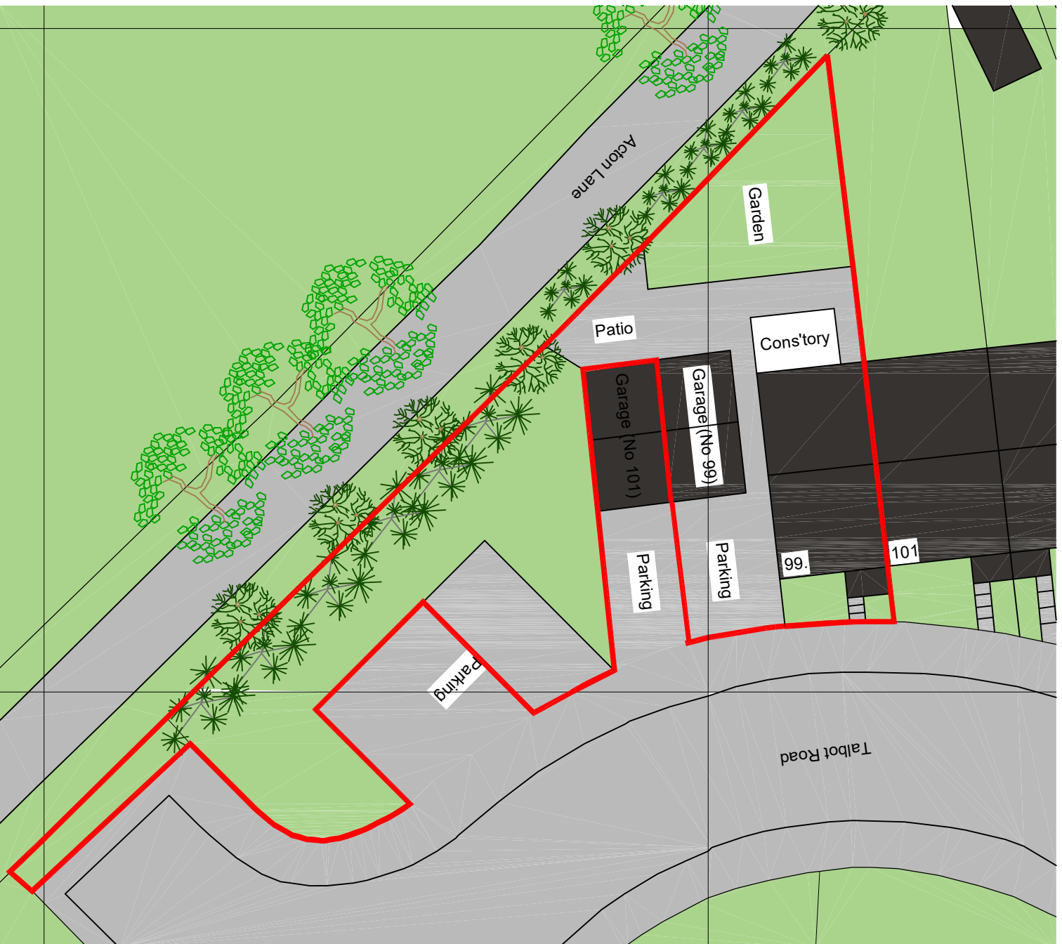
BLOCK PLAN – AS EXISTING.