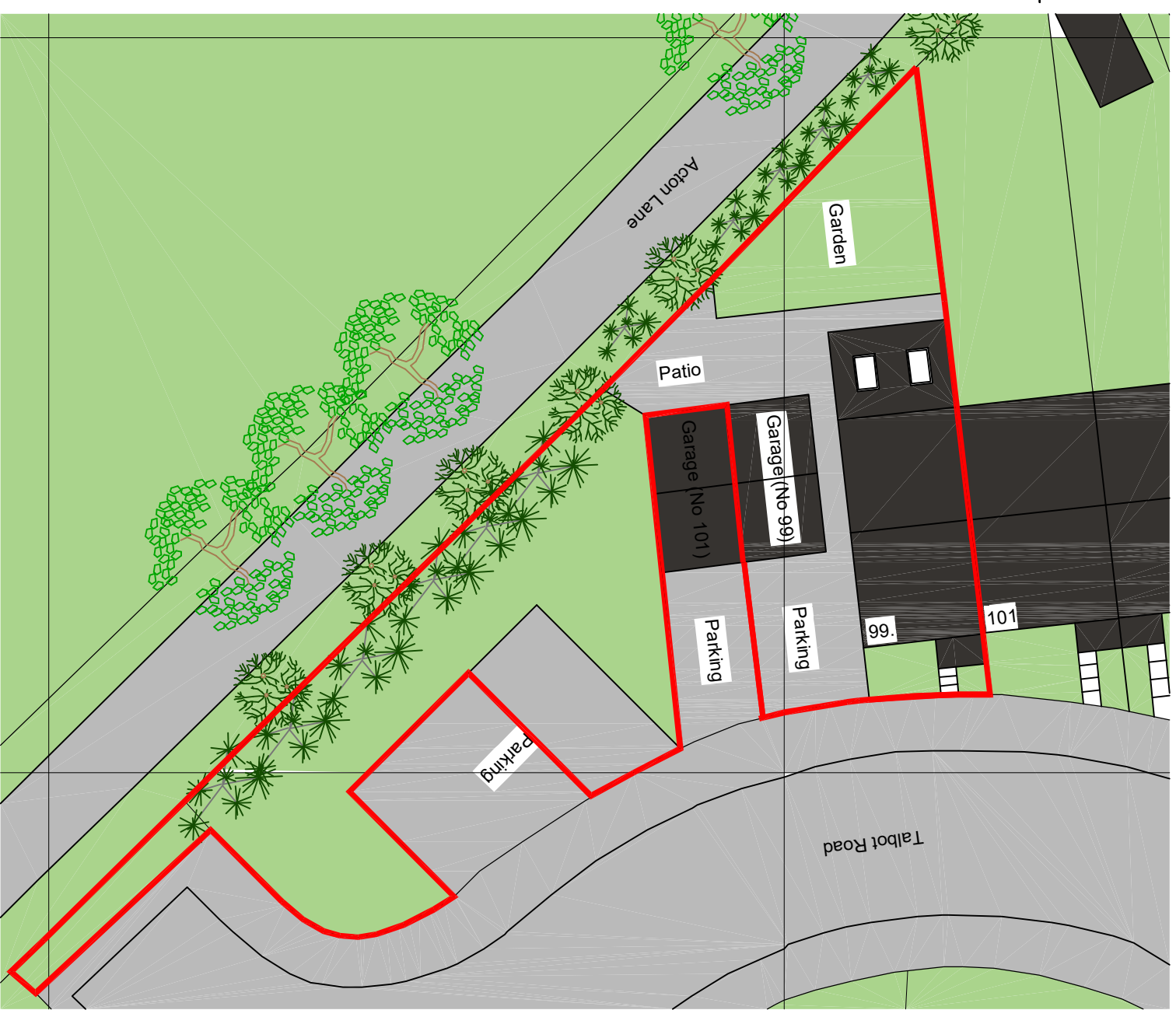
BLOCK PLAN – AS PROPOSED.