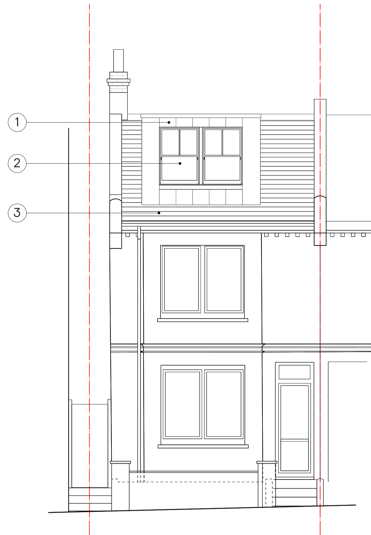
1 Proposed Front (South) Elevation Scale: 1:50