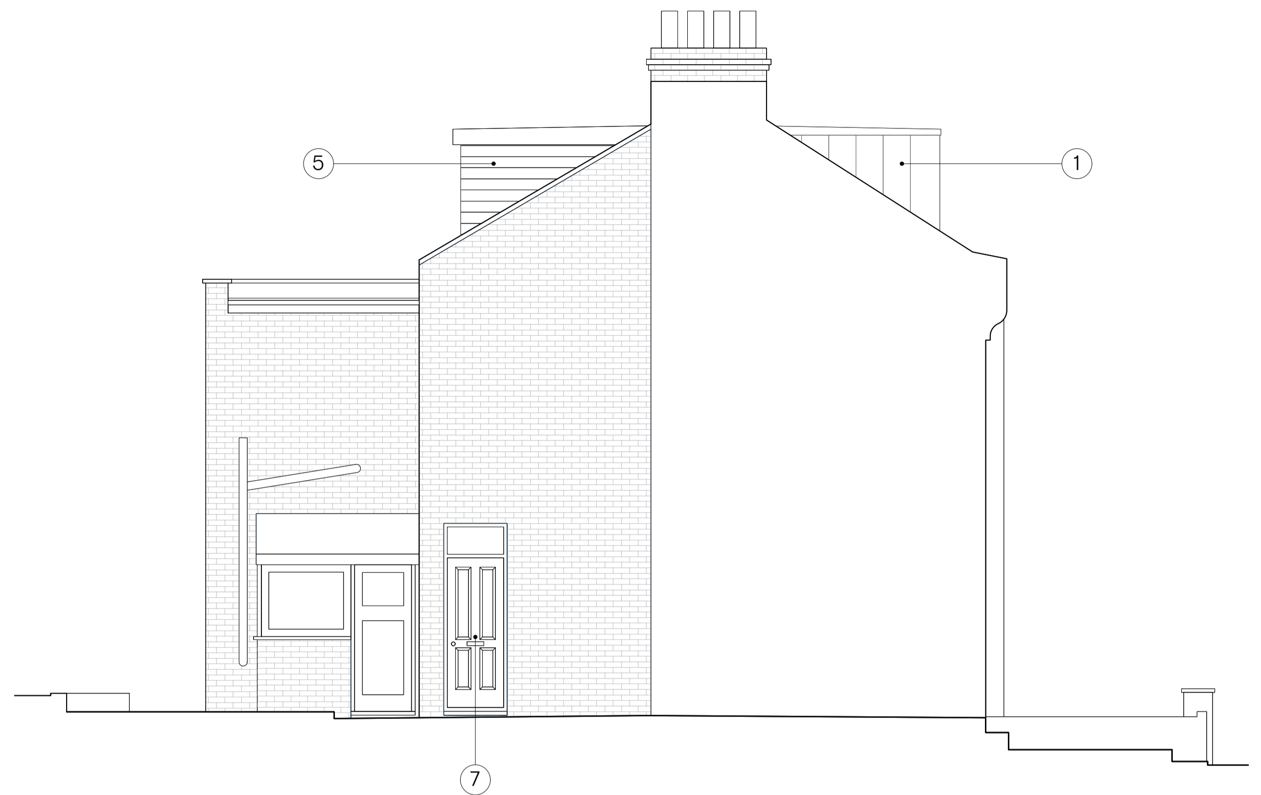
3 Proposed Side (West) Elevation Scale: 1:50