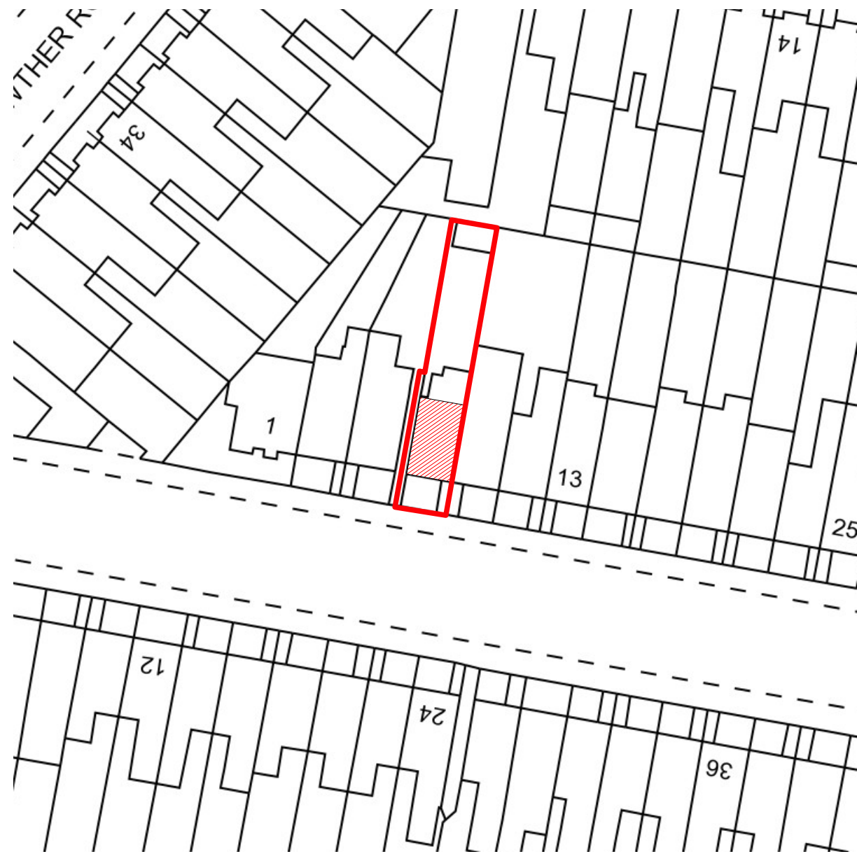
2 Site Block Plan Scale: 1:500