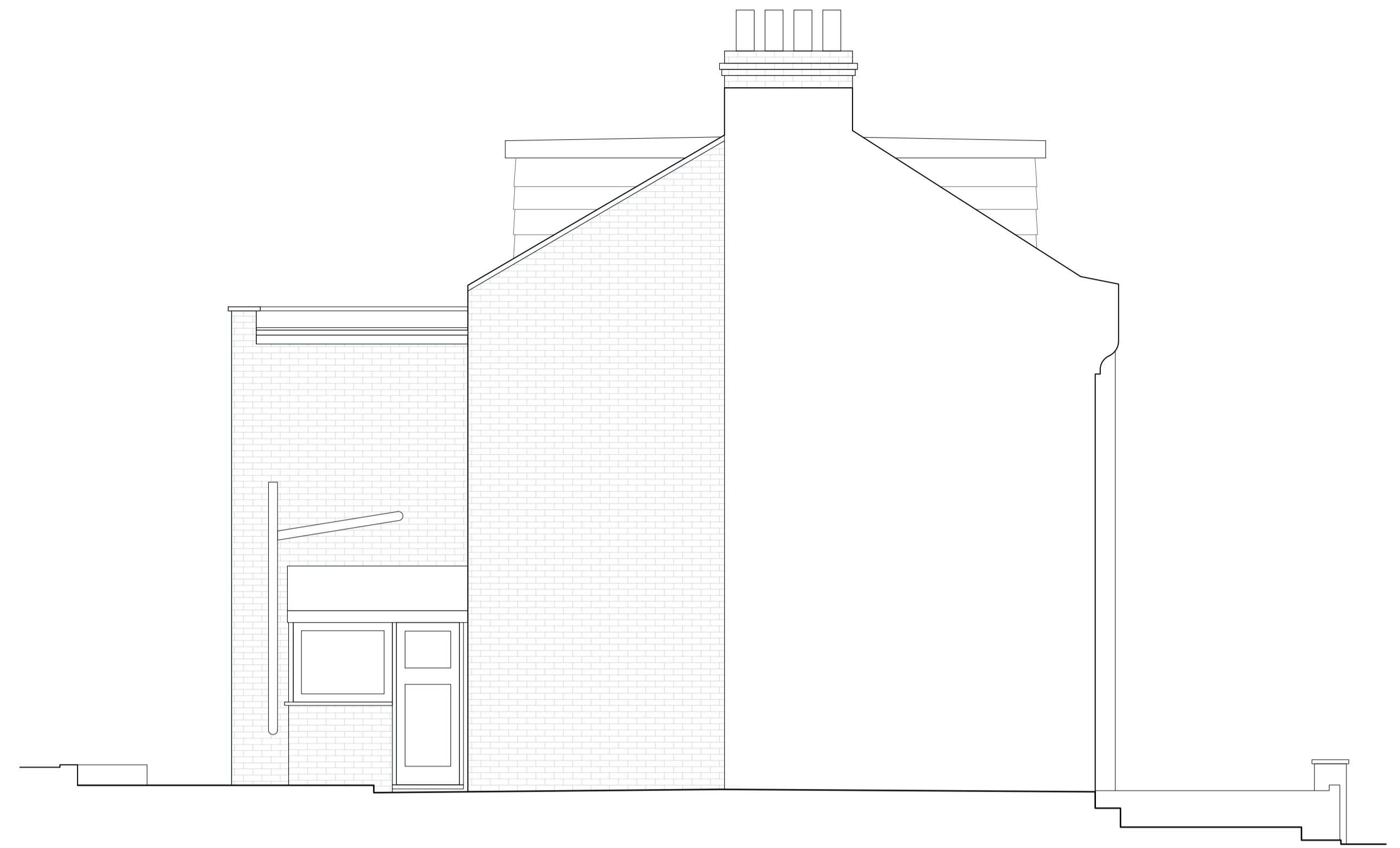
3 Existing Side (West) Elevation Scale: 1:50