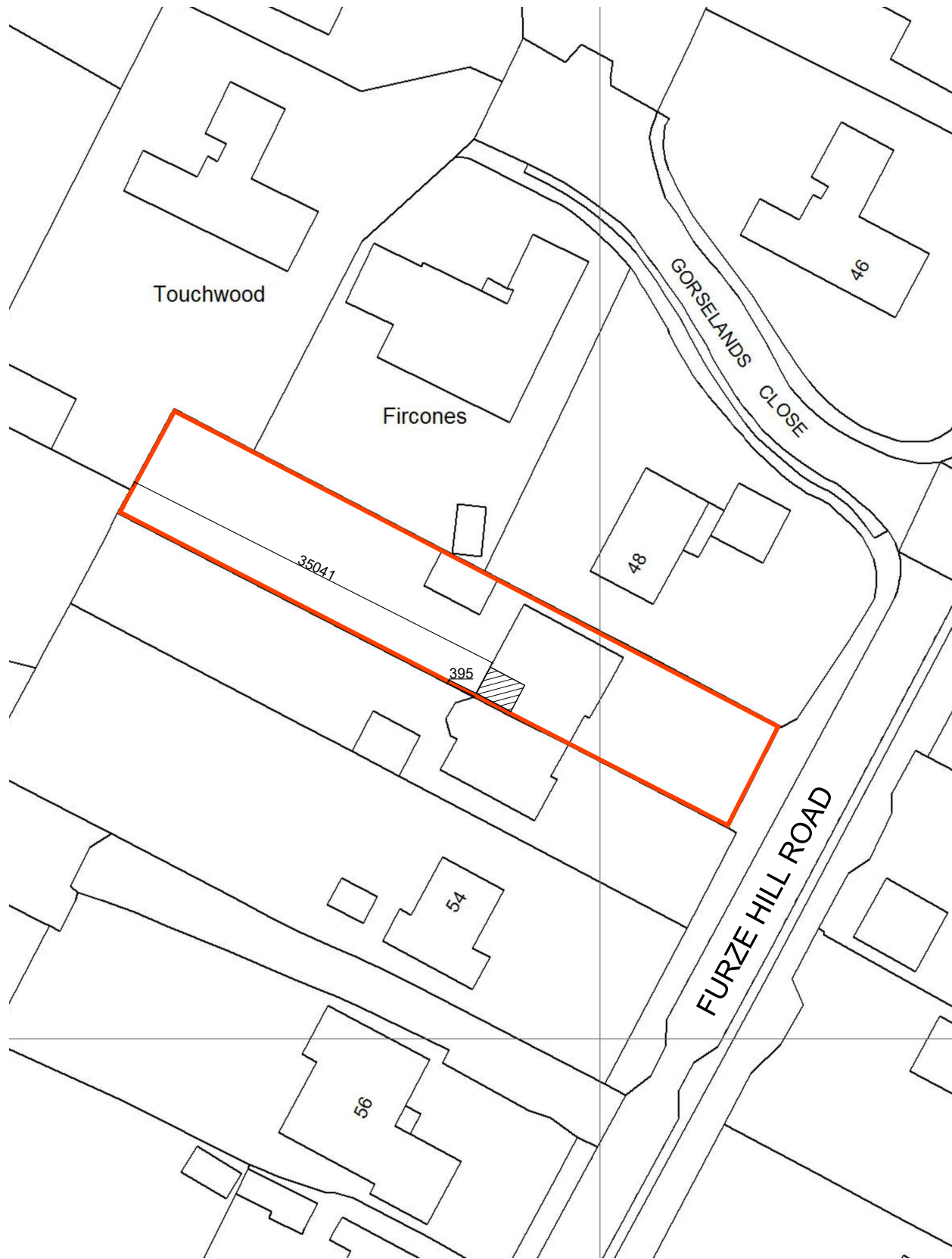
BLOCK PLAN (1:500)