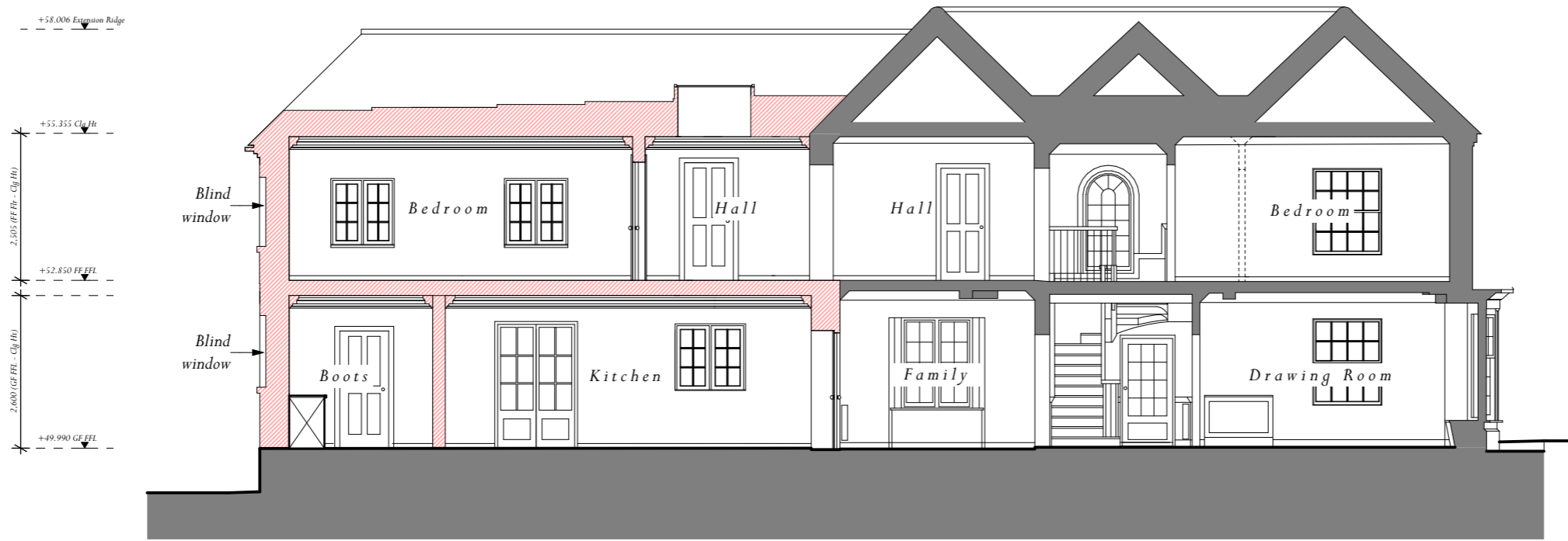
PROPOSED SECTION A - A