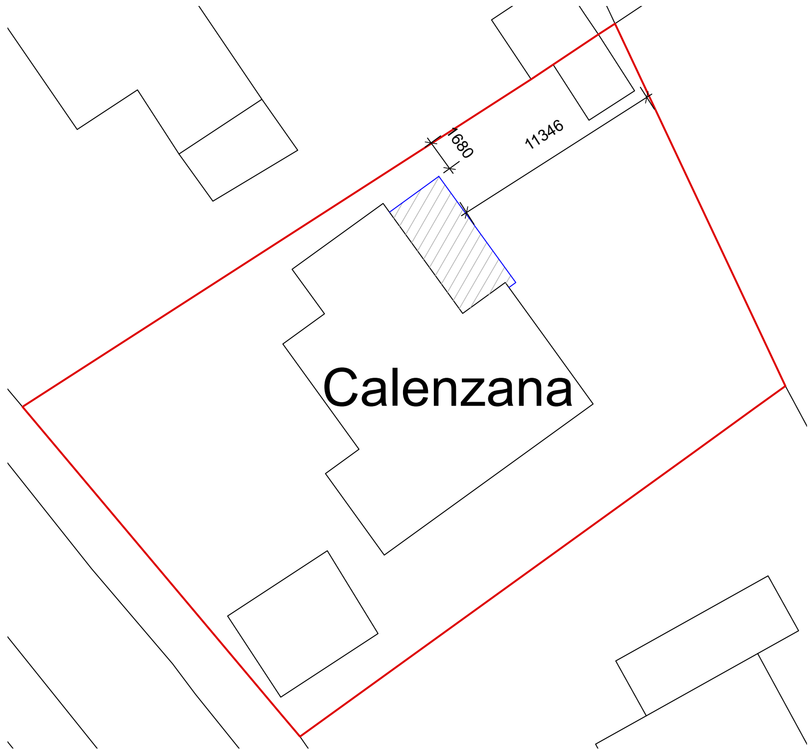
2 Site Plan Scale: 1:200