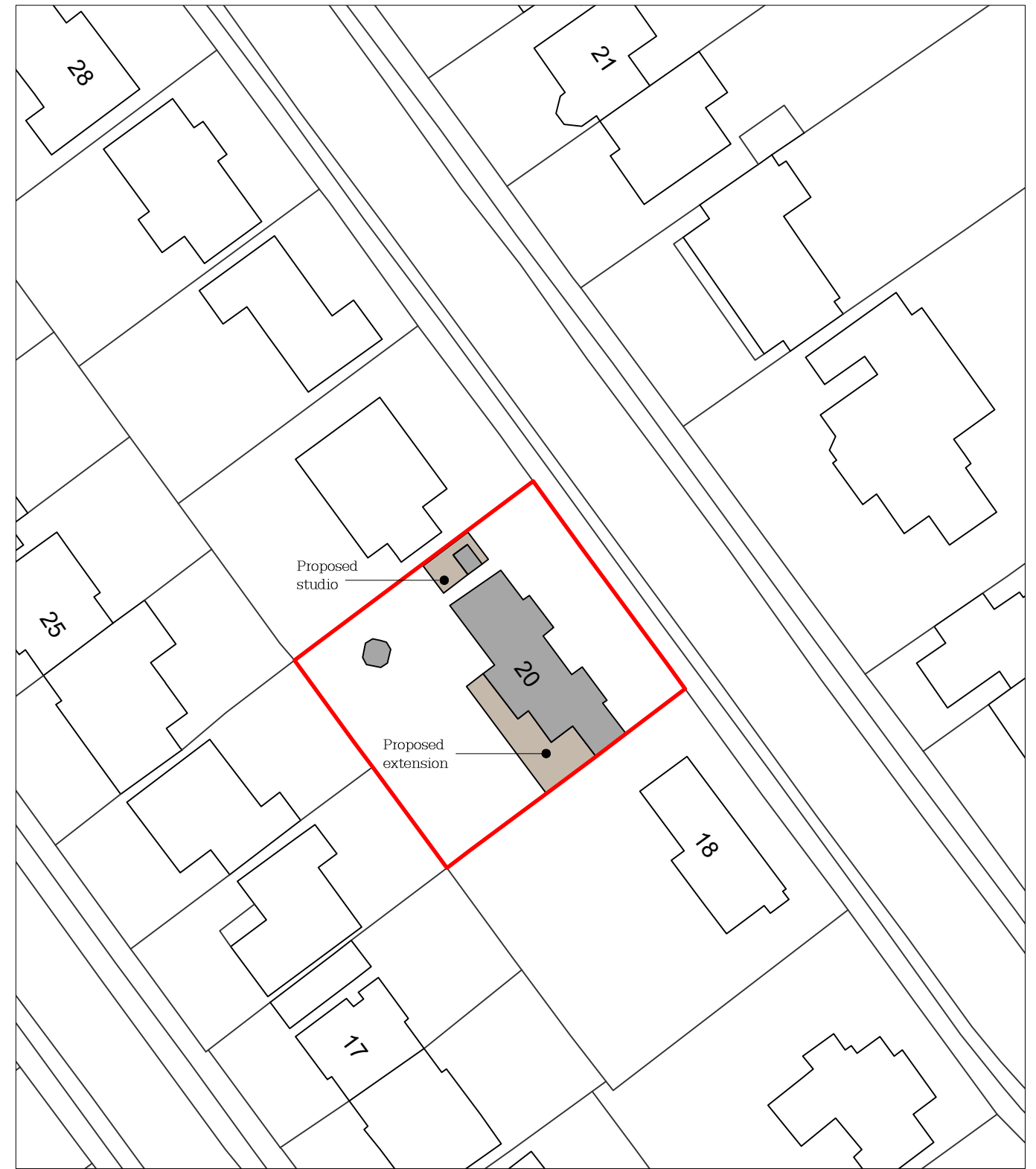
Block Plan - 1:500