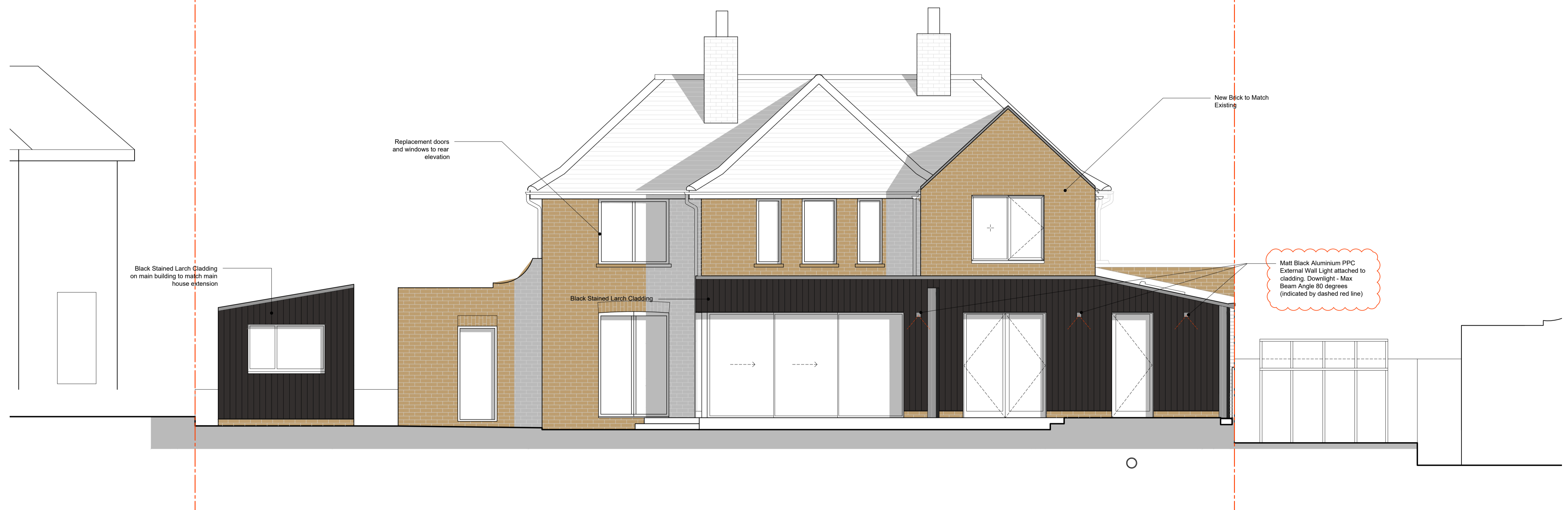
2 Proposed Rear Elevation 1:50

22 Gundreda Road | 20 Gundreda Road | 20 Gundreda Road | 18 Gundreda Road