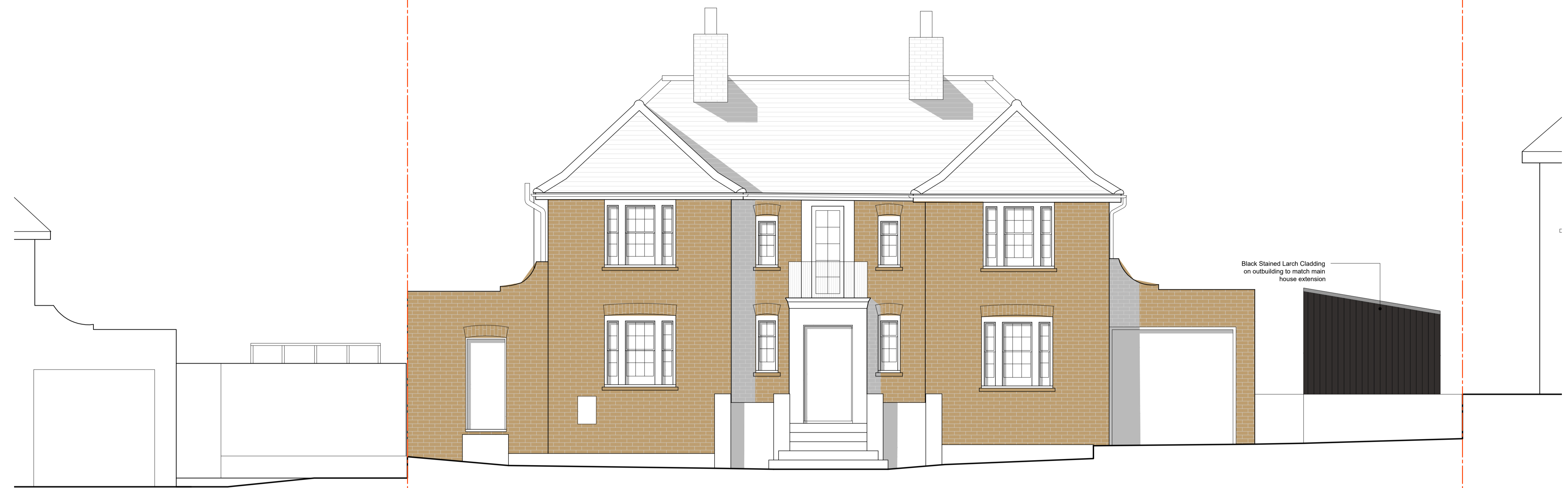
1 Proposed Front Elevation 1:50

18 Gundreda Road | 20 Gundreda Road | 20 Gundreda Road | 22 Gundreda Road