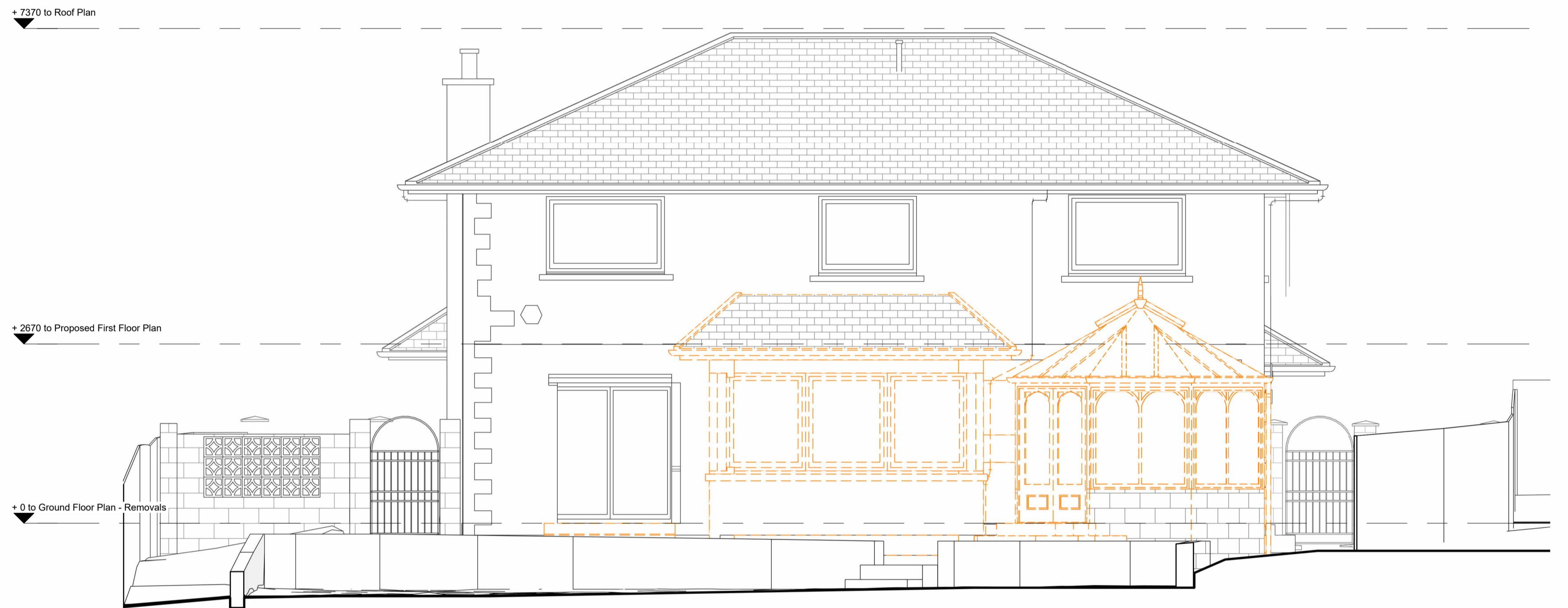
North Elevation - Removals 1 : 50