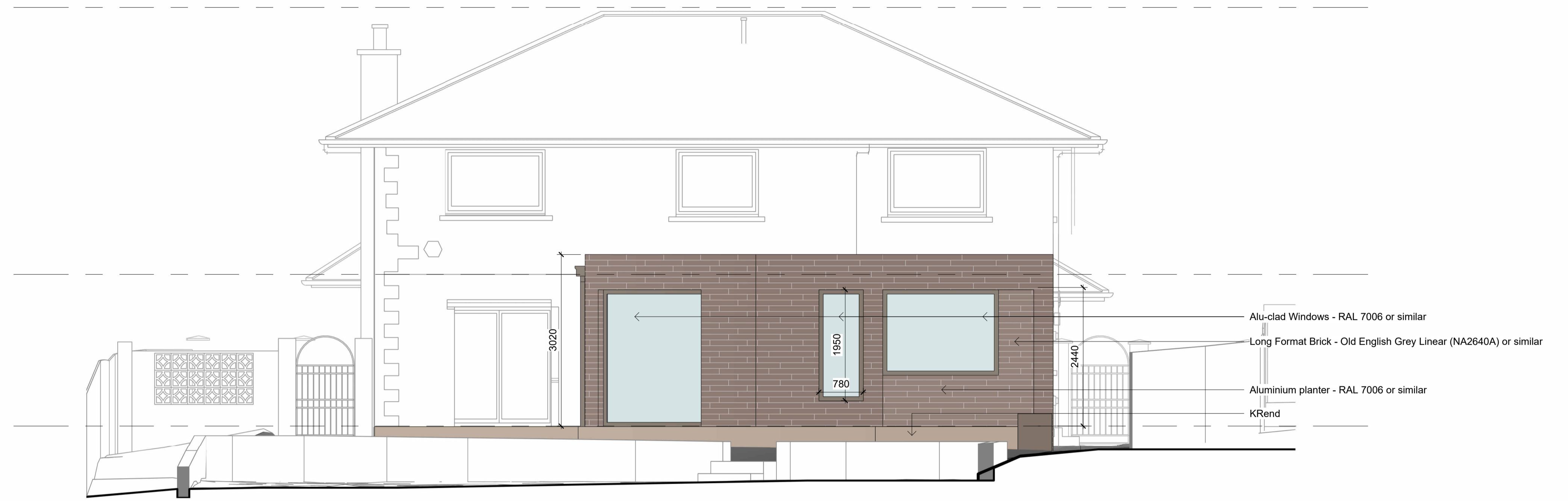
North Elevation 1 : 50