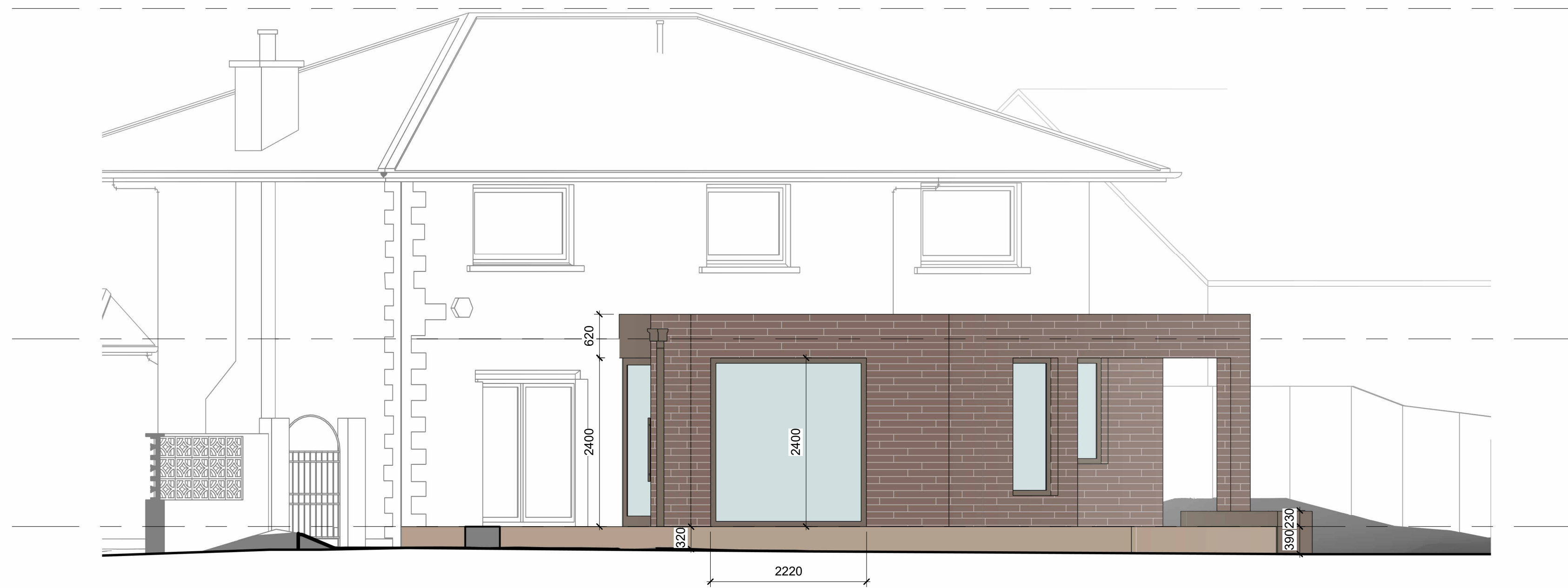
North-East Elevation 1 : 50