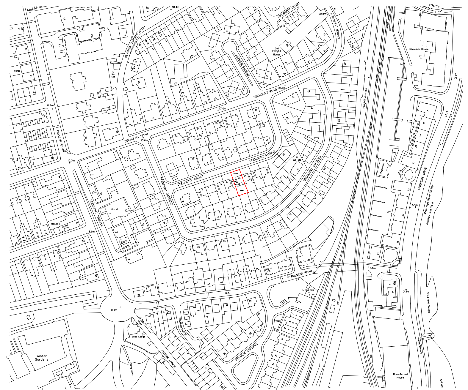
Location Plan scale 1:2500