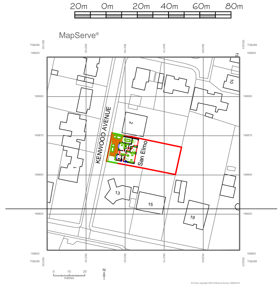
Proposed Site Location Plan - Scale 1:1250

Proposed Demolition of Existing Conservatory & single storey Rear Extension to dwelling, single storey side extension to Garage & First floor Roof Extension to provide additional accommodation at San Elmo, Kenwood Avenue, Longfield, Dartford, Kent DA3 7EX