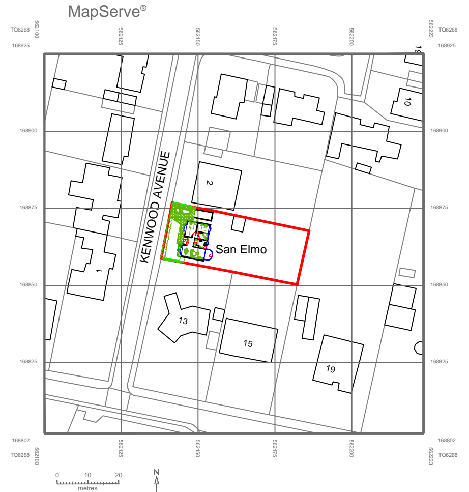
Existing Site Location Plan - Scale 1:1250