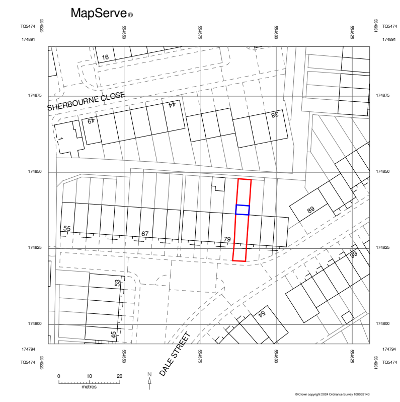
2 Location Map 1 : 1250