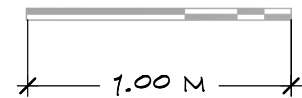
Side Elevation (north)