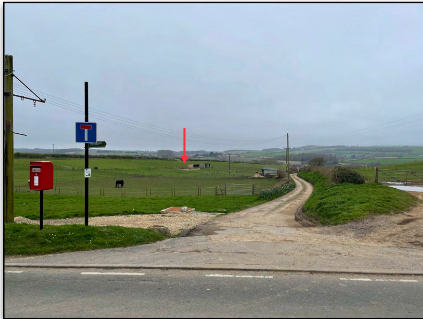
View of the Turnout pen from Niton Road. The turnout pen is barely visible from the road. The garage is not visible