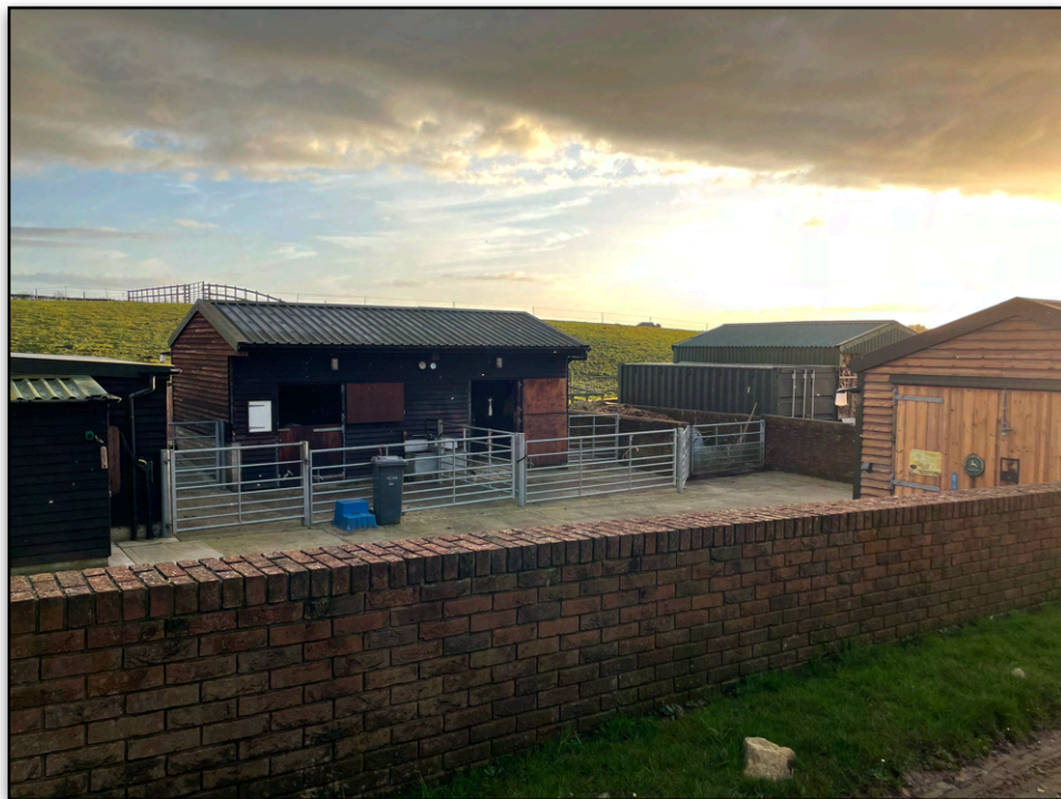
Stable yard, stables and behind a field used for equine purposes adjacent to all three cottages further west along the bridleway