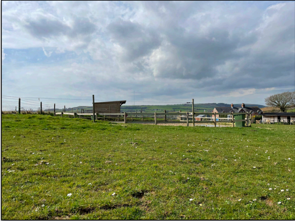
View of pen looking towards the east