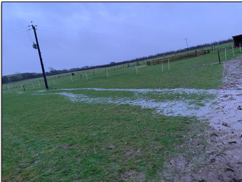
Wet weather field conditions

There is no impact on our neighbours and they have no issues with the garage.