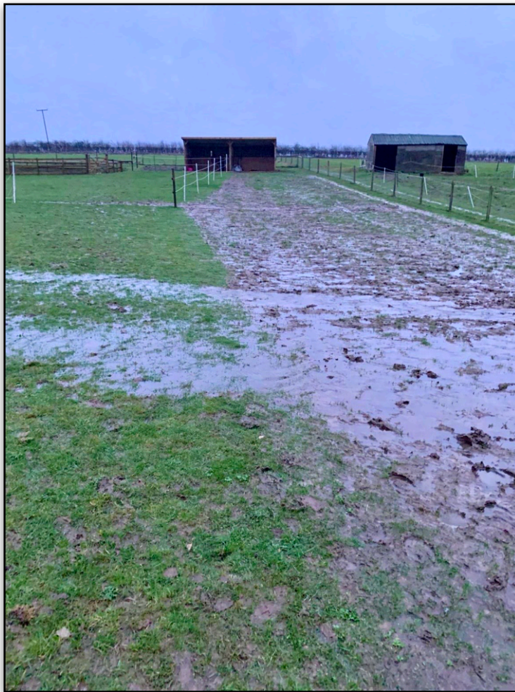
Wet weather field conditions

There is no impact on our neighbours and they have no issues with the garage.