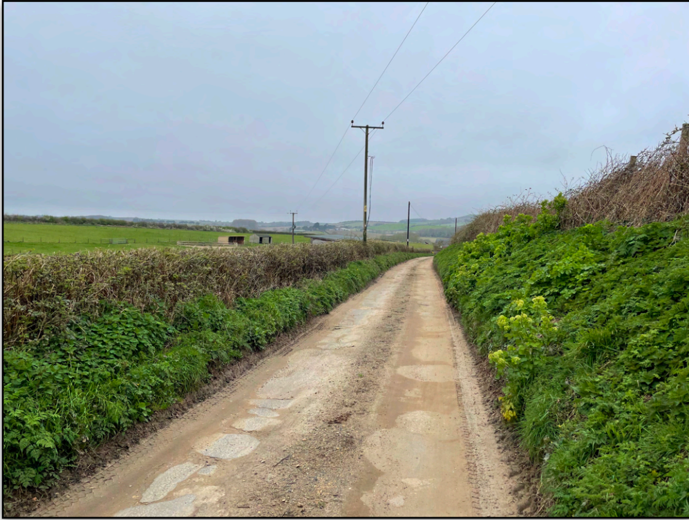
View proceeding onto the bridleway from Niton Road