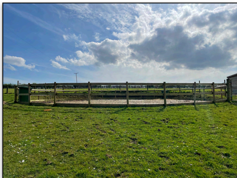
Turnout area south view