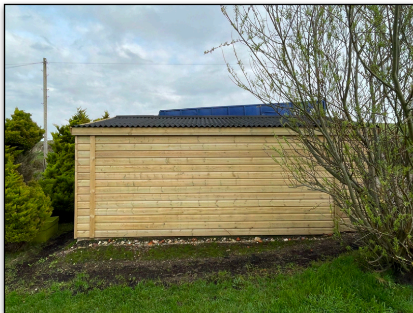
Left side / Northerly Aspect