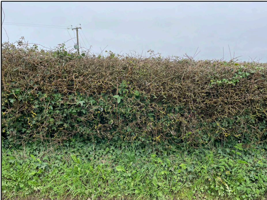
Proceeding past the gate, the view is obscured by the established hedge