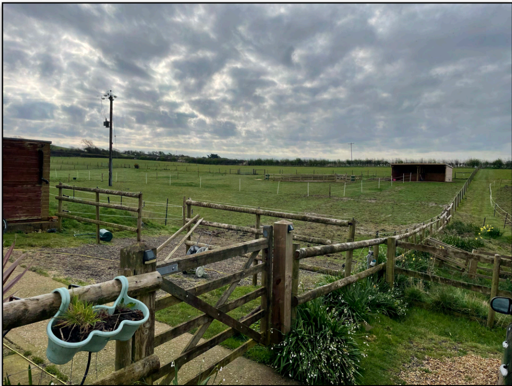
View of pen from stables