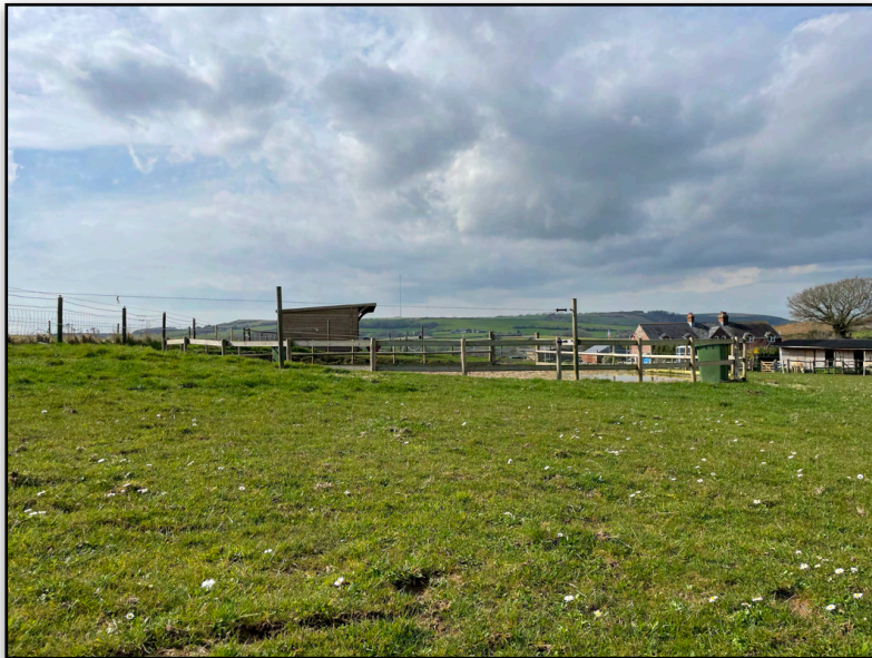
Turnout Area Easterly view