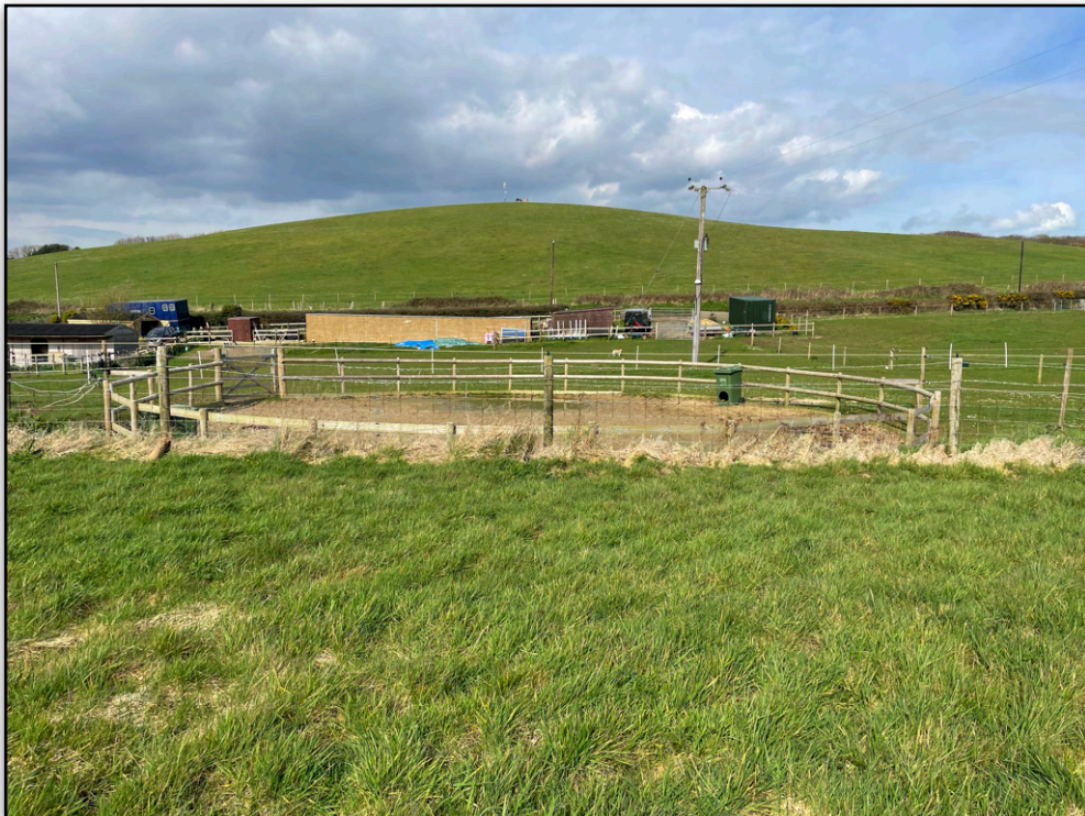
View of pen looking towards the north