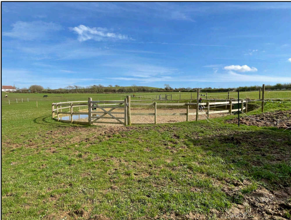
Pen view looking eastwards

There is no impact on our neighbours and they have no issues with the round-pen. The round-pen has been in situ since Aug 2022 and (19months at time of application), and we have had no issues raised in relation to any harm caused.