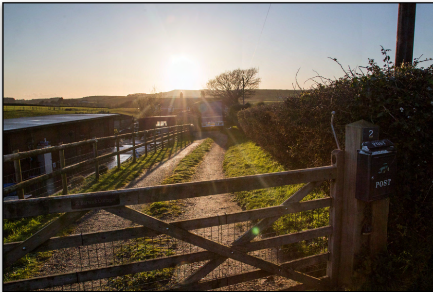
This is the view from the property entrance. The bridleway is to the right of the image separated by a pull in area in front of the gate. Even here the garage is barely visible and has no impact. To the left of the image are the established stables.

The garage cannot be seen from Niton Road and only comes into view when you have already travelled some distance easterly along the bridleway. However, a full view of the garage is not possible from the public area and what can be seen quickly disappears from view as you walk a short distance further (see images at the end of the document as this will also cover the Turnout Area in this context).