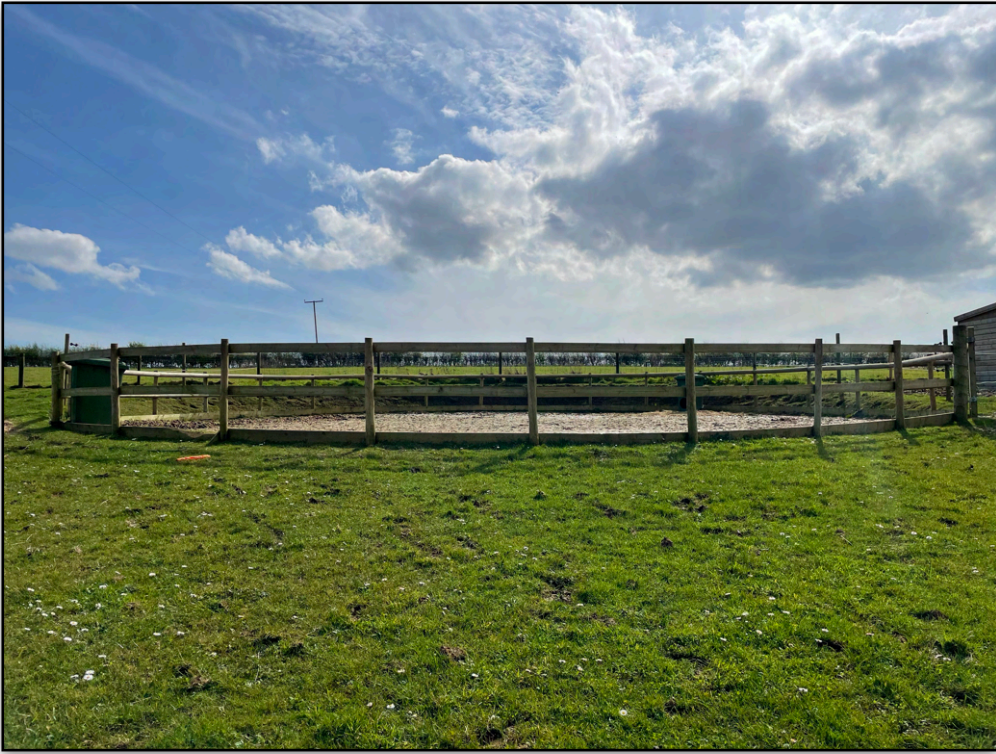
View of pen looking towards the south