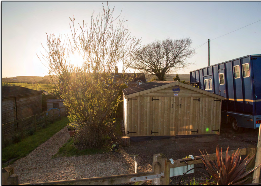
Front wide view. Dwelling houses 30m in the background. Neighbours stables to the left / south