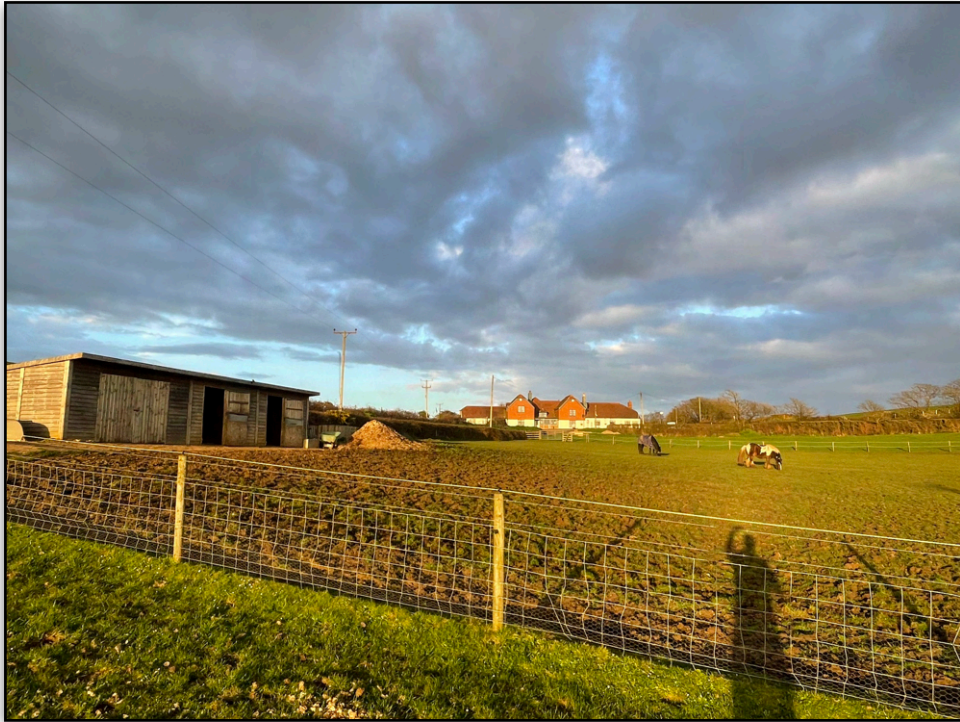
Easterly neighbouring field being used for equine purposes