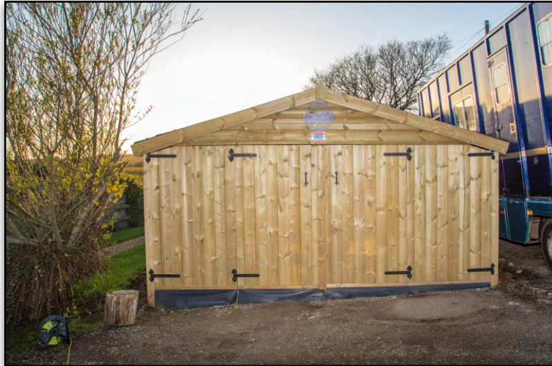
Front / east elevation