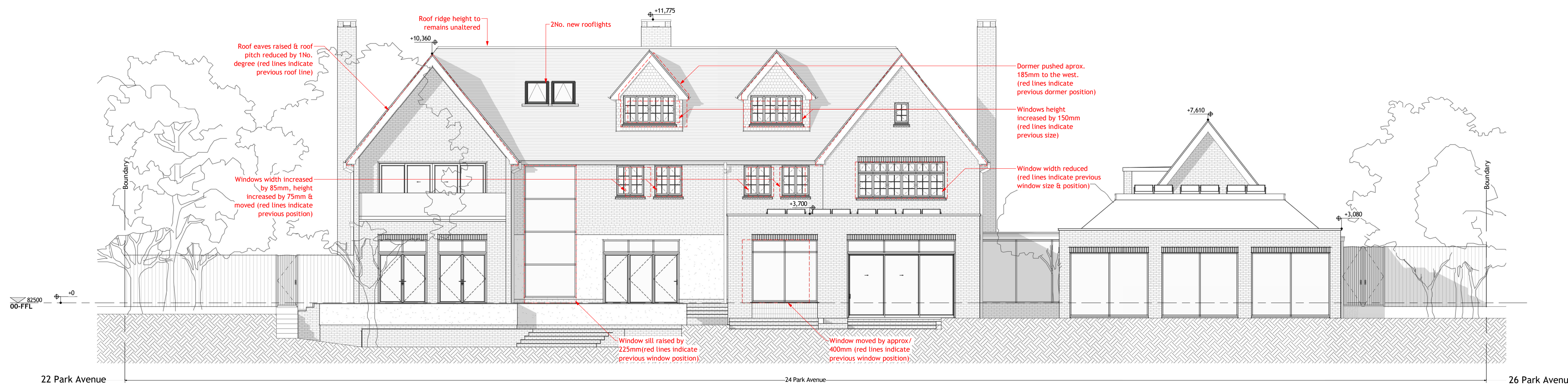
Proposed Elevation - South General Arrangement | Scale 1 : 100