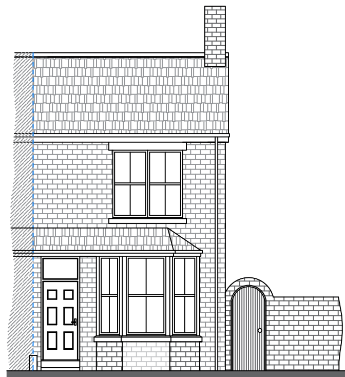
Existing Front Elevation Scale 1:100