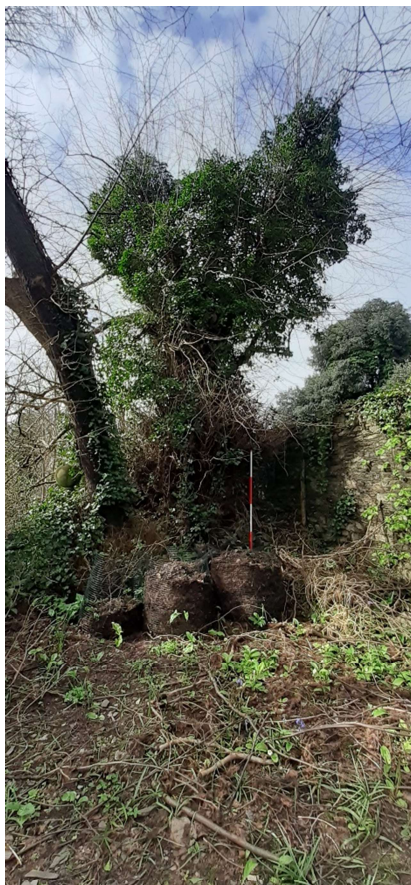
T2 Clad of ivy